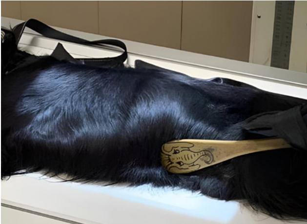
Figure 1. Setup for the EAP radiography, with the dog in right lateral recumbency and a wooden spoon compressing the abdomen in a craniodorsal direction just behind the last rib.

brachycephalic obstructive airway syndrome (BOAS), but actually display mixed aerodigestive clinical signs (Freiche and German, 2021). This is caused by the common occurrence of sliding HH in brachycephalic dogs and the associated gastroesophageal reflux (GER) that is a major contributor to the clinical signs (Luciani et al., 2022). It causes regurgitation of food and water, discomfort and hypersalivation, reflux esophagitis, esophageal stricture formation, vomiting, coughing, and aspiration pneumonia (Mayhew et al. 2023; Freiche and German, 2021; Hall et al., 2020). Brachycephalic dogs with HH can also present without typical gastrointestinal clinical signs and solely display respiratory symptoms and aspiration pneumonia (Luciani et al., 2022). Correction of the upper airway obstruction together with the HH improves the clinical outcome (Mayhew et al., 2023). Correctly identifying this underlying digestive disorder is therefore warranted.