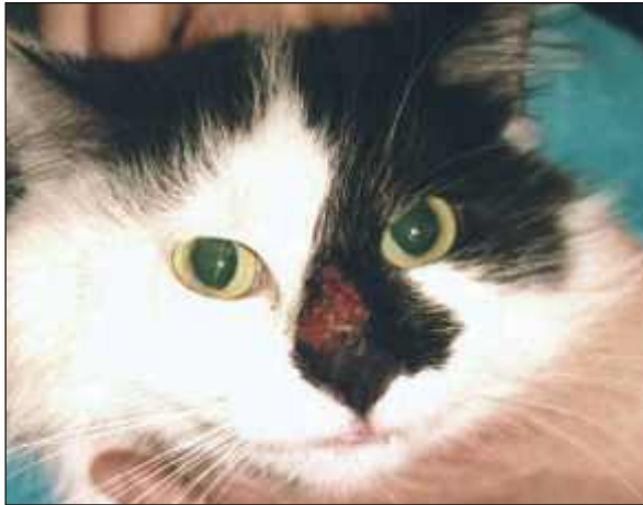
Figure 1. The tumour area after cleaning and removing the crust, immediately before photodynamical therapy with 5-aminolaevulinic acid and red Light Emitting Diodes.