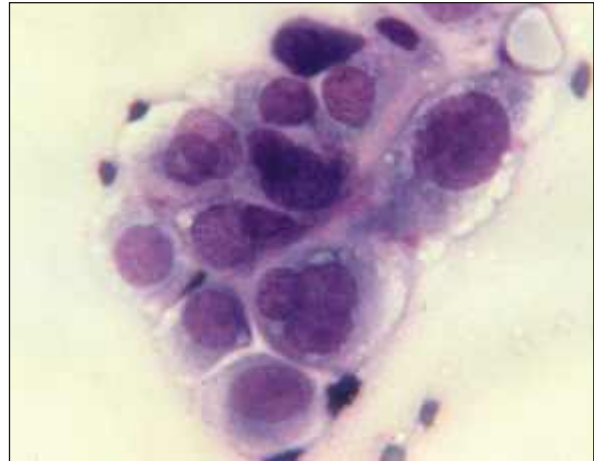
Figure 2. Cytological appearance of a tumour grade T1 (Owen, 1980; Hahn and Richardson, 1995; Moore and Ogilvie, 2001).