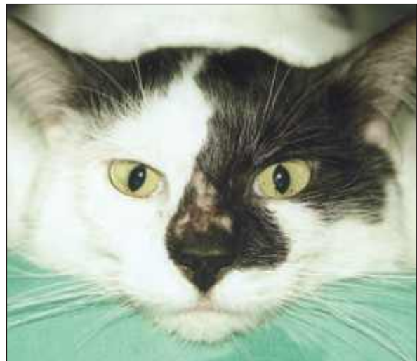
Figure 4. Response at the time of the first visual observation, one month after the photodynamical therapy with 5-aminolaevulinic acid and red Light Emitting Diodes. The tumour is cleared from the nasal planum, the crusting lesion has disappeared and normal epithelia is emerging.

of 48 hours following the treatment. Consequently, no local anesthesia was administered, though as a precautionary measure an Elizabethan collar was applied for 24 hours to prevent licking, rubbing and scratching.