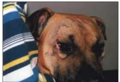
Figure 7. Both eyelids 10 days after surgery.