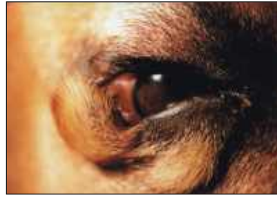
Figure 2. Close-up of the right eye: Combined coloboma-dermoid of the lateral aspect of the lower eyelid and another dermoid medially.