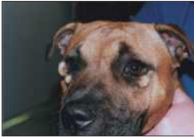
Figure 1. A five-month-old Staffordshire Bull Terrier with abnormal lower eyelids.