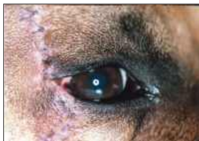
Figure 6. Right lower eyelid 10 days after surgery.