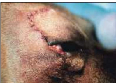
Figure 5. Right lower eyelid immediately after surgery.