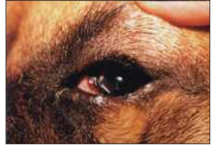
Figure 3. Close-up of the left eye: lower eyelid entropion, dermoid and paracentral corneal opacity (attachment of persistent pupillary membranes to the posterior aspect of the cornea).