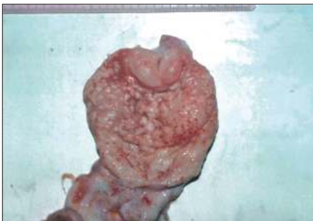
Figure 1. Gross appearance of the urinary bladder with emphysematous cystitis.

Histopathologically severe fibrinopurulent pleuritis and pericarditis were also seen. Purulent pneumonia was observed in the lungs, especially near the pleura. Slight neutrophil leukocyte infiltrations were present in liver and kidneys. In addition to these findings, acute catarrhal enteritis was observed. There were no lesions observed in the pancreas consistent with diabetes mellitus.