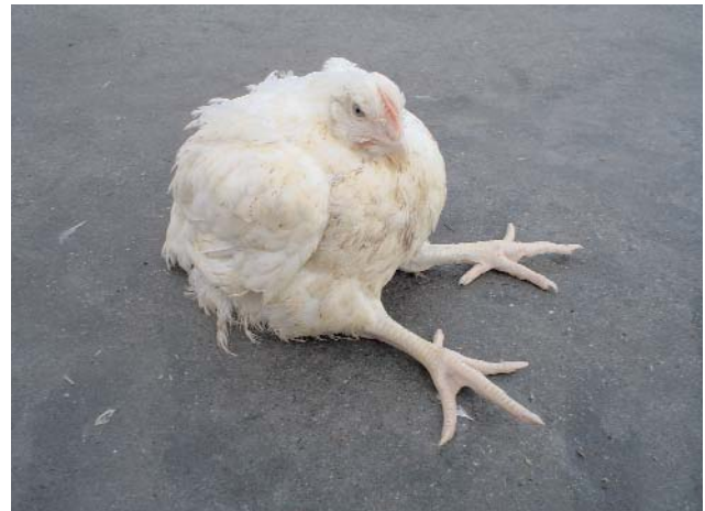
Figure 1. Thirty-nine-day-old broiler chick sitting on its back parts with the legs directed forwards. This typical posture is due to compression of the spinal cord at the caudal thoracic vertebrae resulting from E. cecorum induced lesions of osteomyelitis.

strongly increased mortality rates during the growing period. Moreover, dehydrated birds were subject to slaughterhouse condemnation, thereby elevating the flock condemnation rates.