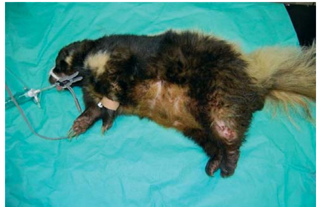
Figure 1. 6-year-old anesthetized male skunk before the surgical intervention (lumbosacral laminectomy). The animal is intubated and a 22 G IV catheter is placed into the left cephalic vein. A pulse oximeter probe is positioned on the tongue. Note the skin lesions of the left hind limb due to the paralysis of this limb.

Twenty four hours later, following a fastening period of 6 hours (but with free access to water), anesthesia was induced again following the same protocol. After intubation, enrofloxacin 10 mg/kg intramuscularly (IM) (Baytril 2.5%, Bayer NV/SA, B-1050, Brussels, Belgium), carprofen 4 mg/kg subcutaneously (Rimadyl 5%, Pfizer Animal Health S.A., B-1348, Louvain-la-Neuve, Belgium) and NaCl 0.9% intravenously (IV) at a rate of 10 mL/kg/hour were administered. Forty minutes after induction, after the preparation of the surgical field, the patient was transferred to the surgical theatre, positioned in sternal recum-