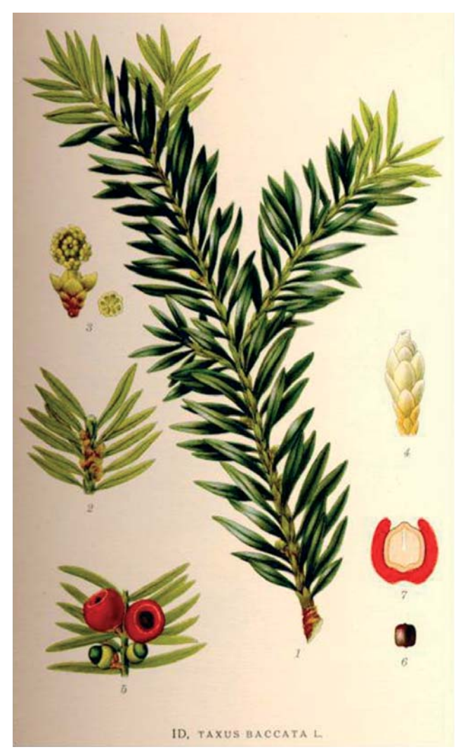
Figure 2. Taxus baccata

The black locust ( Robinia pseudoacacia ) has also been reported to cause fatal poisoning of horses in Belgium, usually after horses are tethered to and subsequently eat the bark of poles made of this wood (S. Croubels, personal communication). Also Nerium oleander is known to cause fatal intoxications in horses (Durie et al. , 2008).