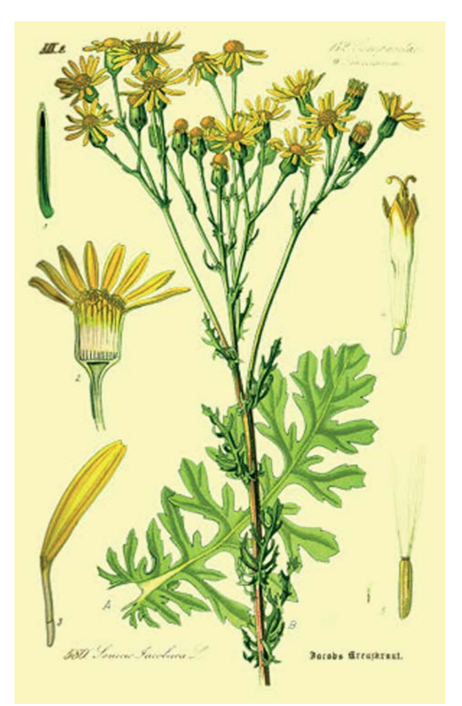
Figure 3. Senecio jacobaea

In 2004, an unusual case of wood poisoning in dogs that ate Simarouba amara shavings was described at the Department of Medicine and Clinical Biology of Small Animals at Ghent University. Simarouba amara, commonly referred to as marupa or caixeta, is a tropical hardwood tree in the Simaroubaceae family from South America. Two male Labradors developed bleeding erosions/ulcerations involving the oral mucosa, mucocutaneous junctions of the lips, node, prepuce and anus, ulcerated nodules on the chin and crusting lesions on the elbows, hocks and scrotum. The dogs had recently been exposed to bedding containing Simarouba amara shavings and, because of the striking similarities of the clinical signs to those described for horses, a probable diagnosis of wood poisoning was made. This assumption was supported by the clinical course, as healing of the skin lesions occurred when the dogs were no longer exposed to the bedding (Declercq, 2004).