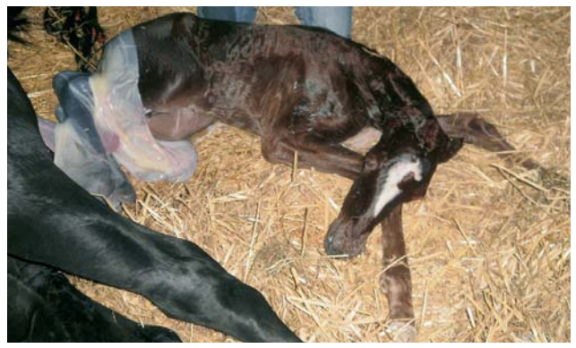
Figure 4. Birth of SMICSI.

In this study a cleavage rate of 85% was obtained, which is comparable to the results of other recent publications and which is rather good when it is considered that the ICSI procedure was performed in the conventional way without the use of the piezo drill. However, only 2 out of the 23 injected oocytes (8.7%) reached the blastocyst stage, a fairly low number when compared to other reports of 15.2% (Colleoni et al., 2007) and 23% (Hinrichs et al., 2007). Possible explanations might include differences in oocyte source and culture conditions as well as in the ICSI technique and experience. Even though spectacular blastocyst rates up to 38% have been obtained during in vitro culture of equine embryos in DMEM/F12 (Hinrichs et al., 2005), there are still quantitative and qualitative differences when (temporary) in vivo culture is performed. Recent studies illustrated a higher percentage of equine ICSI embryos developing to the compact morula or blastocyst stage in sheep oviducts (56%) when compared to culture in vitro (20%) (Lazzari et al., 2009). Another intriguing finding was that aberrant expression of a pluripotency