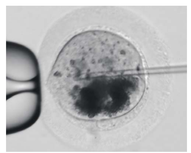
Figure 1. Intracytoplasmic sperm injection (ICSI).