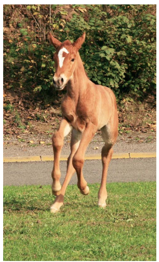
Figure 5. SMICSI 3 days old.

gene in IVP blastocysts, when compared to in vivo derived embryos, could be normalized by 2-3 days culture in an equine uterus (Choi et al. , 2009). Studying gene expression can reveal fundamental differences between equine in vivo and in vitro embryos (Smits et al., 2009). When compared to in vivo derived equine blastocysts, IVP horse embryos have shown to be retarded in the kinetics of development, with more apoptosis and higher levels of chromosomal abnormalities (Tremoleda et al. , 2003; Pomar et al. , 2005; Rambags et al. , 2005).