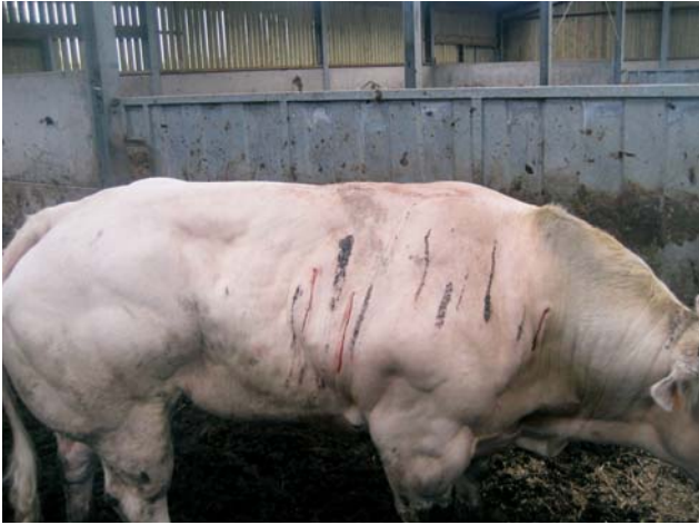
Figure 1. Multiple nodules and three 'bleeding spots' on withers, shoulders and neck of a 3-year-old Belgian Blue breeding bull with parafilariasis.