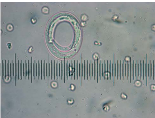
Figure 5. Embryonated egg of Parafilaria bovicola (light microscopy, 400x).