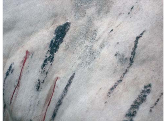
Figure 2. Details of bleeding Parafilaria bovicola nodules (bleeding spots) on the shoulders of a 3-year-old Belgian Blue breeding bull.