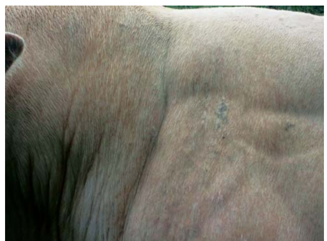
Figure 6. Complete recovery of parafilariasis lesions on the withers, shoulders and neck in a Belgian Blue breeding bull, one week after treatment with moxidectin injectable.