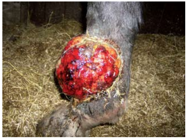
Figure 4. Fibroblastic sarcoid on the dorsolateral aspect of the metacarpus.