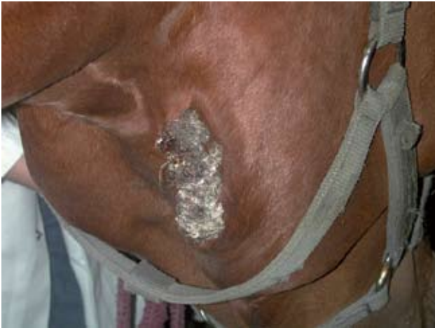
Figure 1. Verrucous sarcoid on the right mandible.