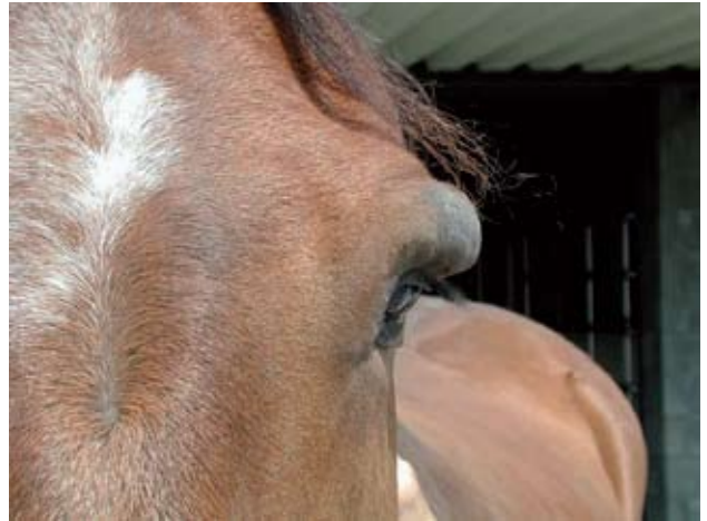
Figure 2. Nodular sarcoid on the upper eyelid.