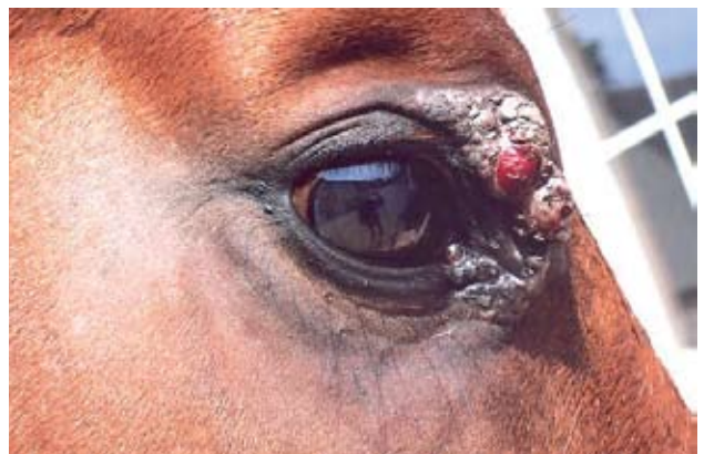
Figure 5. Mixed sarcoid (verrucous – fibroblastic) on the upper eyelid.

Teifke et al. , 1994; von Tscharner et al. , 1996). Epithelial changes seen in sarcoids are likely the result of growth-promoting factors expressed by the neoplastic fibroblasts that stimulate proliferation of surrounding epithelial cells (Carr et al. , 2001a).