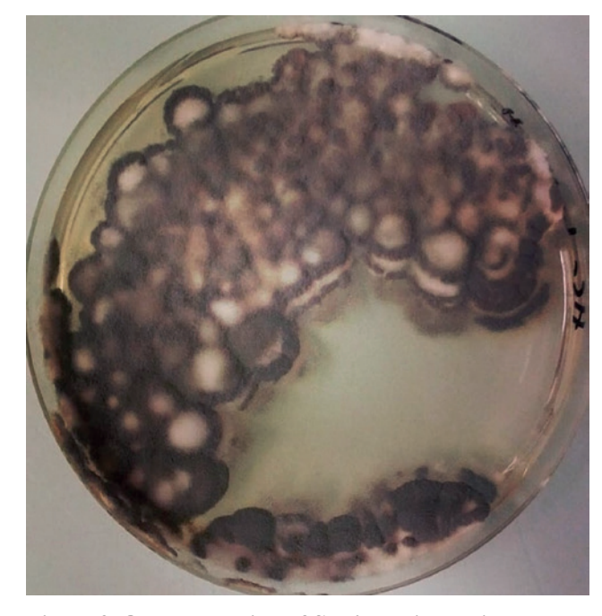
Figure 2. Obverse section of Scedosporium apiospermum growth on Potato Dextrose Agar medium.