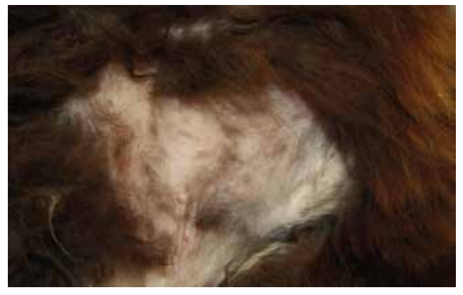
Figure 2. Alopecia of the ventral abdomen.

neoplasia, destroy \beta -cells. Other diseases, such as hypersomatotropism and hypercortisolism, induce diabetes by producing an excess of growth hormone and cortisol, respectively. These hormones cause insulin resistance (Rand, 2013; Niessen et al., 2013). Currently, hypersomatotropism is thought to be the underlying disease in feline DM in 25 to 30% of cases (Rand and Gottlieb, 2017).