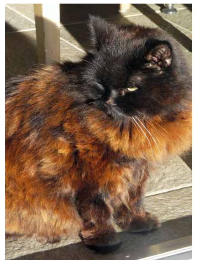
Figure 1. Poor hair coat quality and discoloration.