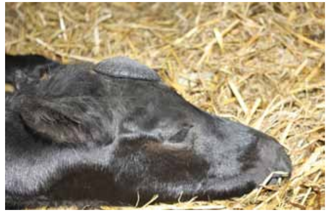
Figure 1. Macroscopic lateral view of the black, flat, oval, pedunculated exophytic mass with a rubber aspect of approximately 10 x 9 x 3 cm on the foal's forehead.

It has been stated that congenital papillomas show the same clinical and histological features as epidermal hamartomas (nevi) in humans (Scott and Miller, 2003; White et al., 2004; Scott and Miller, 2011; Rup-