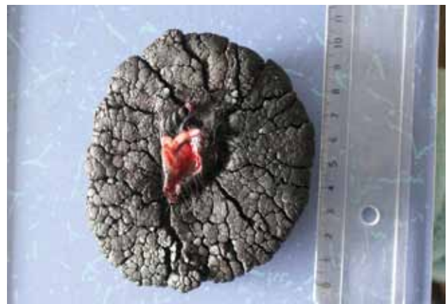
Figure 2. A. Macroscopic dorsal and B. ventral view of the mass after surgical excision through the vascularized peduncle.