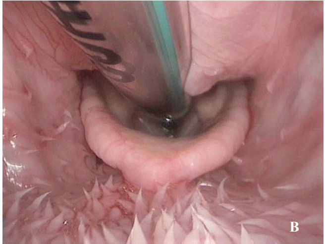
Figure 2. Intra-operative images of a permanent epiglottopexy. A. A wedge of mucosa ventrorostrally on the epiglottis (asterisk) and caudally at the base of the tongue (star) is excised. B. Following fixation by placement of a continuous suture line to the wound bed between the glossopharyngeal and epiglottic mucosae, the position of the epiglottis is assessed with the tongue in a neutral position; the rima glottidis is now patent throughout the respiratory cycle.

airway syndrome (BOAS) and 3/9 dogs (33%) had laryngeal paralysis. The five dogs presented with BOAS had hyperplastic and/or elongated soft palate (4/5), hyperplastic and/or everted tonsils (4/5), laryngeal collapse grade I (1/5), and relative macroglossia (1/5).