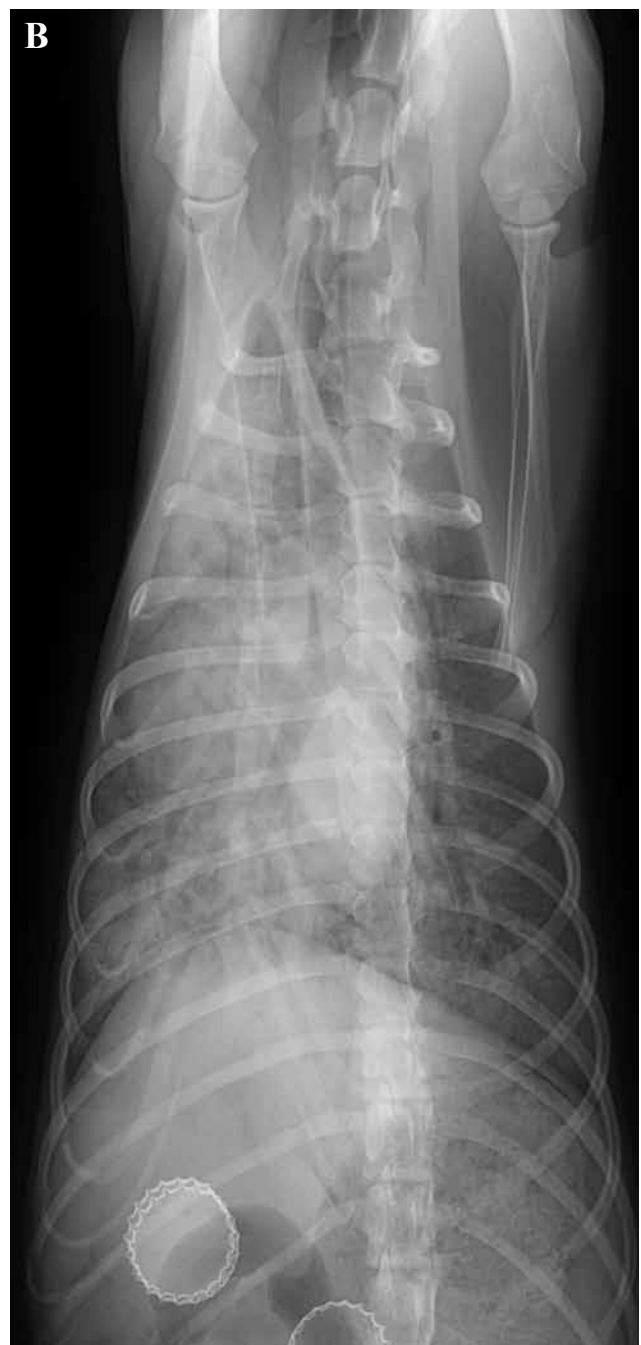
Figure 1. Right lateral (A) and ventrodorsal (B) radiographs performed by the referring veterinarian. Diffuse interstitial to alveolar pattern, more pronounced in right hemithorax. Vasculature cannot be evaluated.

coagulopathy, e.g. due to rodenticide poisoning, disseminated intravascular coagulation (DIC) or Angiostrongylus vasorum infection, or local lung pathology, such as neoplasia. According to the owners, the dog did not suffer from trauma, and no clear signs of local lung pathology were present. Therefore, a coagulopathy was suspected, although platelet count (blood smear), PT and aPTT were within normal limits. The dog was mildly sedated with butorphanol (0.04 mg/kg) and the buccal mucosal bleeding time (BMBT) was measured to detect possible thrombocytopenia. However, the test result was within normal limits. A complex coagulopathy without obvious laboratory abnormalities was suspected and a fresh frozen plasma transfusion (10 ml/kg) was initiated. Packed red blood cells were not administered, since there were no signs of decompensated anemia. Oxygen supplementation was not necessary, since the dog was not dyspneic.