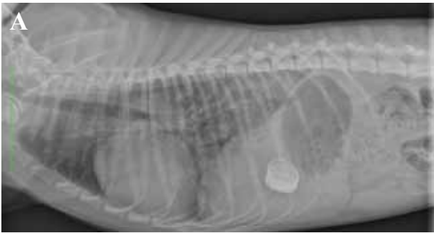
Figure 2. Right lateral (A) and ventrodorsal (B) control radiographs 48 hours later. Patchy, peripherally located interstitial to alveolar pattern, normal vasculature (no dilation of pulmonary artery). Three foreign objects (bottle caps) are present in the stomach.