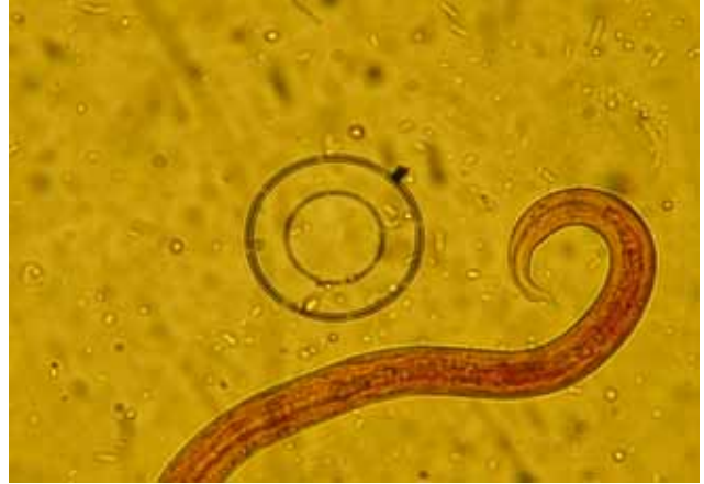
Figure 4. Close-up of the typical S-shaped tail of an iodine stained Angiostrongylus vasorum L1 larva (x40).