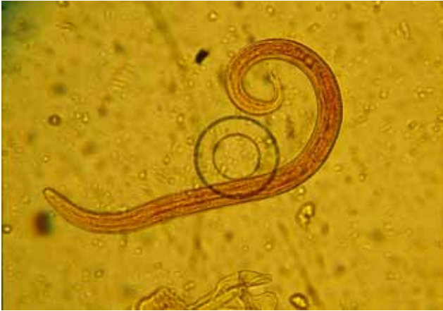
Figure 3. Iodine stained L1 larva of Angiostrongylus vasorum (x20).