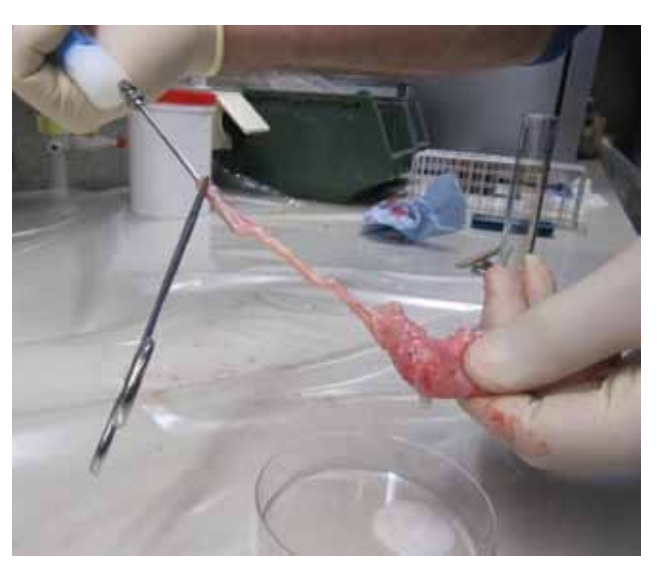
Figure 3. The retrograde flushing technique.

Freezing of epididymal spermatozoa can be performed according to standard freezing techniques (Squires et al., 1999). The ability of epididymal spermatozoa to withstand cryodamage matches the ability of ejaculated spermatozoa to withstand cryodamage within a given individual (Bruemmer et al., 2004). If semen of the stallion has been frozen earlier and the most suitable extender for this individual was determined, this extender should also be used to freeze the epididymal semen. After thawing, no differences are seen between total and progressive motility of epididymal semen compared with ejaculated semen (Weiss et al., 2008). When there are no data on the freezability of the semen of a particular stallion, BotuCrio® should be the extender of choice, because epididymal semen frozen in this extender shows a higher postthaw total and progressive motility than epididymal semen frozen in INRA-82 or EDTA-Lactose (Melo et al., 2008). The addition of pentoxifylline in the