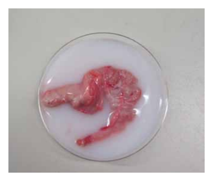
Figure 2. Flotation method.

the extender that will be used for freezing, thus containing cryoprotectant. As an alternative, the cryoprotectant can be added following the incubation period for the float-up method to reduce exposure time to the cryoprotectant.