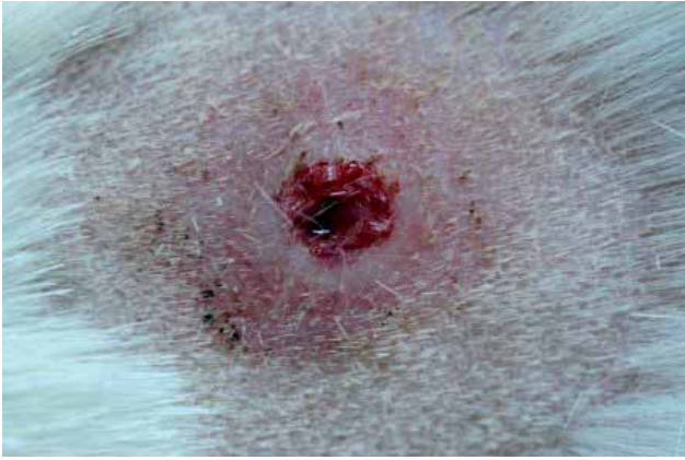
Figure 1. Nodular skin lesion secondary to Neospora caninum infection in the dorsal neck of the dog.

gium seven years ago. One hour before presentation, the owner noticed that the dog started shaking, had difficulties in walking and keeping her balance. The physical examination was normal except for severe pain while moving the head. The neurological examination was normal. A presumptive diagnosis of cervical discus hernia was made, and treatment with prednisolone (Prednisolone, Kela) (1mg/kg/day) and tramadol (Contramal Retard 50 mg, Grünenthal) (2 mg/kg bid) was started.