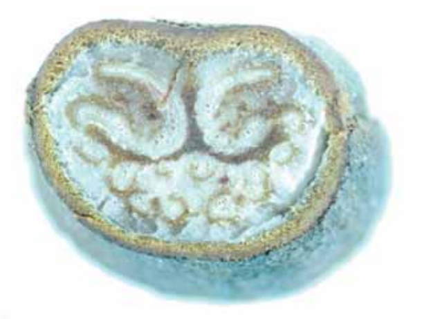
Figure 4. Cross-section of the stem of bracken fern: a manner to identify Pteridium aquilinum (Prof. Dr. Verbeken).

The toxic substances are cyanogenic glycosides (mainly prunasin), a vitamin B_1 -decomposing enzyme (thiaminase) and factors with carcinogenic activity (particularly ptaquiloside) (Fenwick, 1988; Vetter, 2009). The cyanogenic glycosides have only very seldom led to cyanide poisoning in animals (Fenwick, 1988), while thiaminase induces a vitamin B_1 -deficiency in non-ruminants. Horses are particularly susceptible (Evans et al., 1951; Kelleway and Geovjian, 1978), while reports of acute bracken intoxication in pigs are less common, except in young animals after long term exposure (Harwood et al., 2007). Affected animals initially show anorexia and ataxia, followed by convulsions and death. Ruminants on the other hand are generally resistant, due to the synthesis of vitamin B1 by the ruminal microbiological flora. However, polioencephalomalacia associated with vitamin B<sub>1</sub>-defiency has been experimentally induced in sheep using bracken fern rhizomes (Bakker et al., 1980). In cattle, the chronic uptake of the carcinogenic sesquiterpene glycoside ptaquiloside is responsible for the development of bladder tumors (referred to as bovine enzootic hematuria) and intestinal tumors (van der Hoeven et al., 1983; Smith et al., 1988; Potter