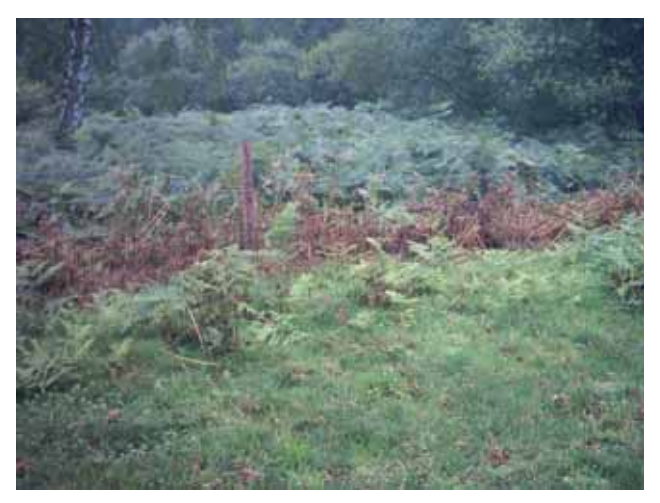
Figure 2. Adult plants of Pteridium aquilinum outside the pasture enclosure and regrowth of fronds within the enclosure observed one week after stabling of the animals.

Necropsy demonstrated an explicit case of a blood coagulation disorder, with hemorrhagic content in the