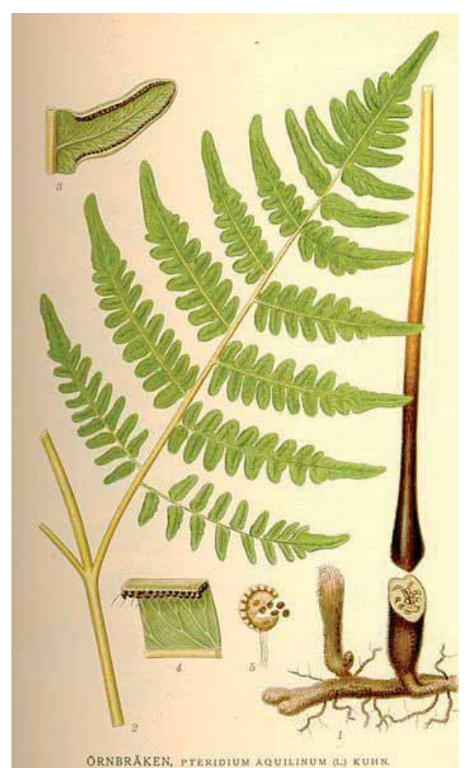
Figure 3. Pteridium aquilinum.

abomasum as well as in the small and large intestines. Furthermore, numerous petechial hemorrhages were observed on the serosae of the abdominal organs. The rumen contained no plants that could be identified with confidence. After necropsy, no further histological analyses were performed.