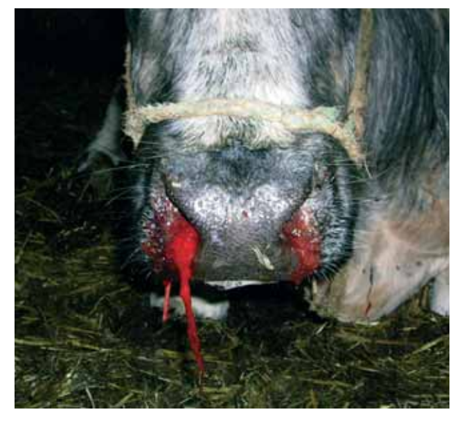
Figure 1. Epistaxis in a three-year-old Belgian blue cow suffering from coagulation disorders due to acute bracken fern poisoning.