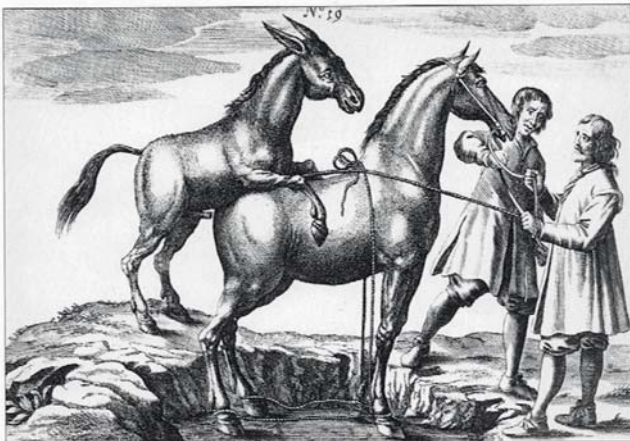
Figure 1. The making of 'veterina'.

Veterinarian is of Latin descent. Country life was highly esteemed by the Romans. Treatises on agricultural topics were popular. It is therefore perhaps not surprising that veterinarius was mentioned in the important compilation work of Columella (about 60 AD), 'De re rustica' (On rural matters). It was not intended to indicate, however, individuals entirely or mostly occupied with animal health care, but rather it designated a person who handled draft and pack animals. Veterinarius is derived from veterinus ( veterina , veterinum ), veterinorum ( veterinarum ) pertaining to 'beast of burden'. Veterinus , possibly stems from vehere , meaning 'to carry' (Littré, 1877). More recent dictionaries link it to vetus : old, as in veteran. This may mean: pack animals too old for military service or