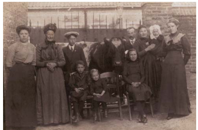
Figure 8. A rather strange member of the family. The world of the rural farm veterinarian in the first half of the previous century (photo taken in an unknown Flemish village, after World War I, year unknown).

In German a similar name, Pferdarzt , was used; the term Ross-Arzt apparently had a lower standing in the 19 th century, indicating men exercising the profession without any diploma.