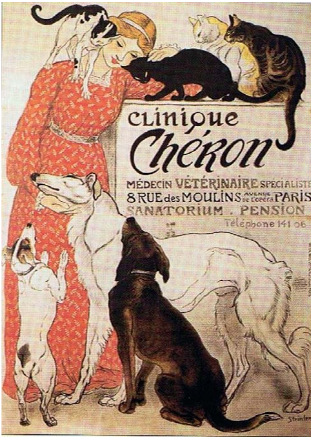
Figure 9. The elegant world of the first small animal practitioners. By Théophile Steinlen (Vevey, 1859 - Paris, 1923), the 'Master of Montmartre' and probably the most famous painter of cats.

age of veterinary professionals (Leclainche, 1936) is a less likely source. In certain rural areas, expert became synonymous with veterinarian and the name is still in use as such.