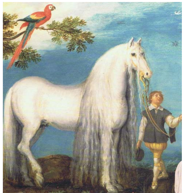
Figure 4. Horse attendant (marshal, veterinarius) with excessively groomed horse (detail). By the Flemish painter Roelant Savery (Kortrijk 1578 - Utrecht 1639), employed from around 1604 onward at the Prague court of emperor Rudolf II.