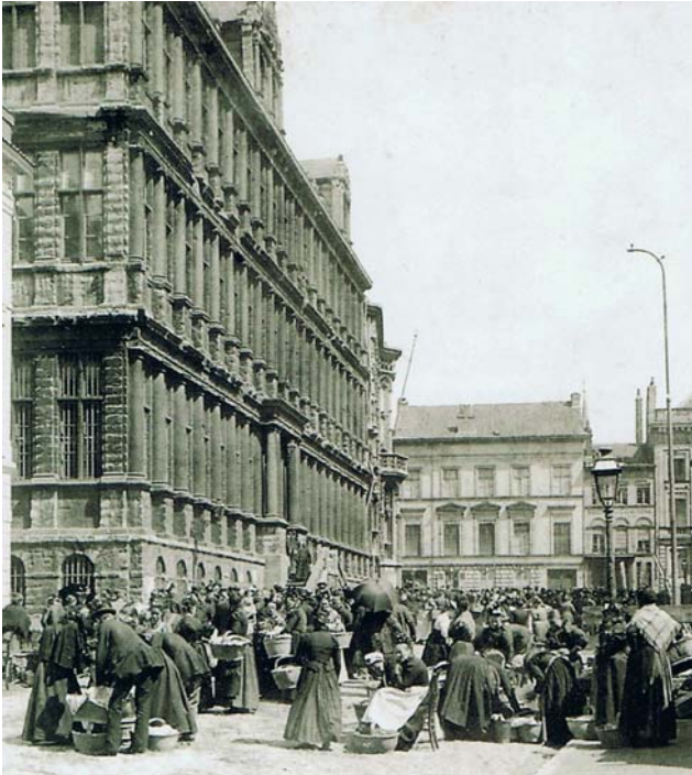
Figure 7. A witness to the high standing and cost of butter in the past centuries. The Butter Market was held on the most prestigious open area in the city of Gent, in front of the town hall. This place changed its name into ‘ Botermarkt ’ (Butter Market) near the end of the 17 th century. It continued to carry this name after the butter disappeared, and it is today’s official designation of the spot and address of the municipality.

work in Latin, known as De medicina equorum , in fact originally had no title, though its opening line stated significantly: Incipit liber maescalcie, mare-stalle ...ipatorie . These texts were often copied, and its prescriptions were introduced into folk medicine. Veterinary ‘art’ borrowed extensively from Ruffus until the 18 th century (Dunlop and Williams, 1996).