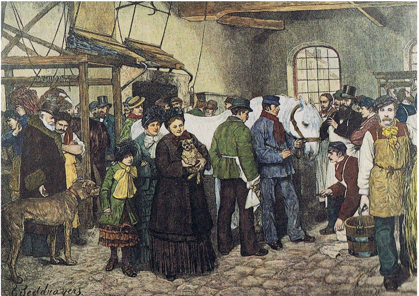
Figure 6. Veterinary clinic of Cureghem (Brussels) in the second half of the 19 th century. Lithograph by Emile Seeldraeyers (Ghent, 1847 - Brussels 1933). The monumental original painting is nowadays on display at the Veterinary Faculty of Liège (Sart-Tilman).

All this happened during a period named in German literature the 'Stallmeisterzeit', to be translated as 'Stable Master Era', somewhat arbitrarily placed in the period from about 1250 to 1762, (von den Driesch and Peters, 2003). The year 1762 is marked by the founding of the first veterinary school in Lyon, and 1250 was taken as a starting point because it is the publication year of the first mediaeval Western European veterinary text book by Jordanus Ruffus (Ruffo or Rosso), Imperialis marescallus major in Frederick's court. This