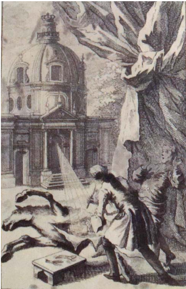
Figure 2. A magnificent illustration of the ‘spirit of enlightenment’, in which the first veterinary schools were founded. ‘Lumen a lumine’ (light through light): the light of science is shining from an academic building into the intestines of a dissected horse, examined by a neatly dressed gentleman (a scientist!). ‘Ignorance’ is horrified and withdraws in shadow and darkness (frontispiece of Elémens d’Hippiatrique , 1751, of Claude Bourgelat, founder of the Lyon and Alfort schools, and collaborator in the famous Encyclopédie of Diderot and d’Alambert).

racés (Dictionnaire historique, 1992) or: old and experienced enough to carry or to pull loads, or even more specifically, ‘one year old, hence strong enough to carry burdens’ (Chambers Dictionary of Etymology, 1988; Klein’s Comprehensive Etymological Dictionary, 1971). In any case, the relationship with ‘beast of burden’ is evident.