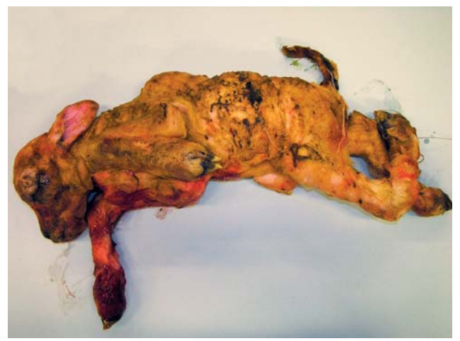
Figure 1. Typical clinical image of a newborn affected by Schmallenberg virus infection.