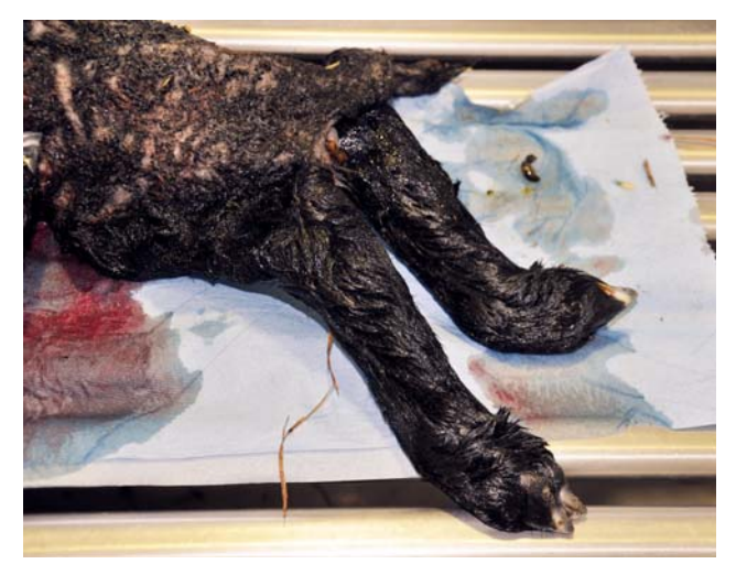
Figure 5. Severe arthrogryposis in a newborn lamb caused by Schmallenberg virus. Notice the severe ankylotic joints in the hind limbs.