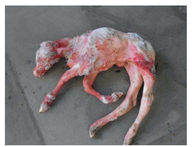
Figure 4. Intra-uterine Schmallenberg virus infection of a neonatal calf.