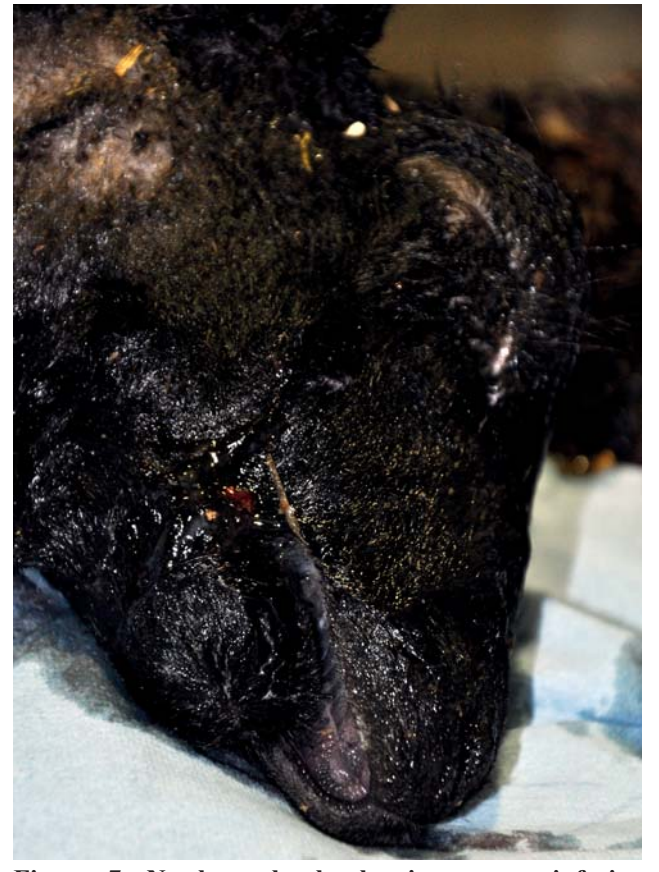
Figure 7. Newborn lamb showing severe inferior brachygnathism due to Schmallenberg virus infection in utero.

fection during gestation. Infection during the first trimester results in grossly deformed fetuses, mostly dead at birth with limbs locked in extension or flexion. Most live neonates have central nervous disorders ranging from dullness, blindness and deafness to severe paralysis and incoordination. Within the central nervous system, hydranencephaly, hydrocephalus, agenesis of the brain, microencephaly, porencephaly and cerebellar cavitation, etc. have been variously reported. The cerebellum however, remains unaffected after Akabane infection, but Schmallenberg virus can cause agenesis or hypoplasia of the cerebellum. Additionally, musculoskeletal abnormalities, including arthrogryposis, torticollis, scoliosis, brachygnathism and kyphosis, are often observed. Veterinarians should remain vigilant of the fact that dystocia at parturition may occur owing to the deformities in the fetus (Whittem, 1957; Kurogi et al., 1977; Parsonson et al., 1977, 1981). The final clinical image of a newborn depends on how many limbs are involved and, more importantly, how many of the higher functions are impaired because of the brain lesions. Even when the cerebrum is entirely absent, all vital functions may be intact and the neonates can possibly stand and walk independently. Exceptionally, some of them have been reared to maturity and have calved in a normal way (Parsonson et al., 1977, 1981).