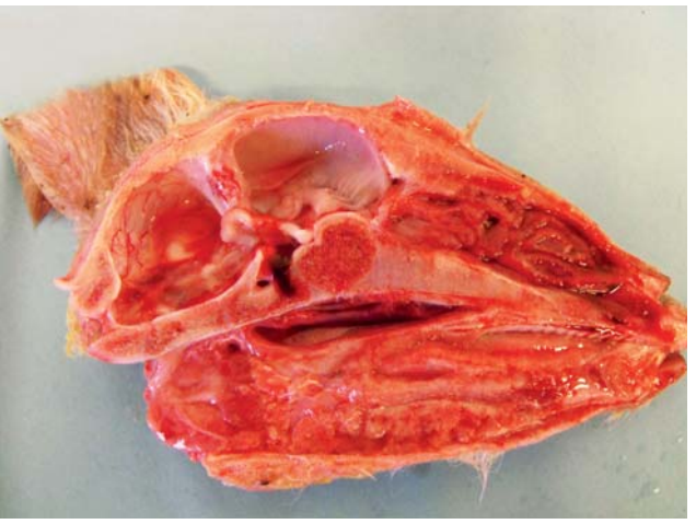
Figure 2. Hydranencephaly caused by Schmallenberg virus in a newly born lamb.