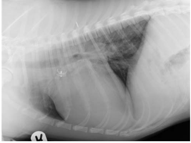
Figure 3. Intraoperative radiography to confirm the exact positioning of the occluder.

low, Essex, UK)) was begun. After preanesthetic examination, the patient was classified as ASA IV. Premedication was with pethidine (4 mg/kg, IM). An IV, 23 G catheter was placed in the right cephalic vein. General anesthesia was induced with etomidate (0.9 mg/kg; Hypnomidate, Janssen-Cilag Ltd., UK) and midazolam (0.3 mg/kg; Hypnovel, Roche Products Ltd., UK) IV 45 minutes after premedication. The trachea was intubated using a 7 mm I.D. cuffed ETT and anesthesia was maintained with isoflurane vaporized in oxygen delivered via a mini-Lack system. Monitoring was the same as described in case 1 (with no CVP). The patient received cefuroxime (20 mg/kg) and furosemide (2 mg/kg; Dimazon 5%, Intervet Ltd., UK) IV. After transport from the preparation room to radiography, and positioning in left lateral recumbency, IPPV was instituted to maintain normocapnia. Fentanyl (0.1 µg/kg/minute) and lidocaine (50 µg/kg/minute; Lidocaine Hydrochloride 2%, Hameln Pharmaceuticals Ltd., UK) were infused IV during the procedure.