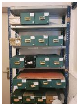
Different facilities of the RAG Archive.

During this time, the archive gradually found its place within the institution: it increased its holdings, established a framework to regulate its activity, increased collaboration with other departments, and gained