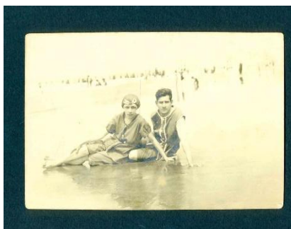
Family documents.

Some other papers stored at the RAG archive also include miscellaneous collections of photographs, postcards and manuscripts: 25 collections that bring together documents of great relevance due, in many cases, to their ephemeral nature, which makes them documentary rarities.