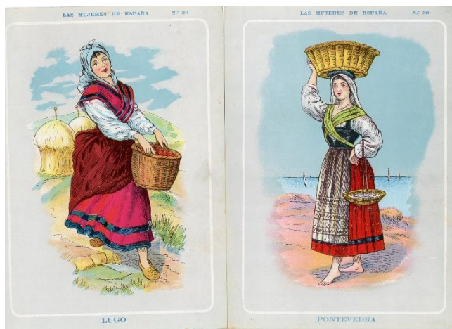
Images of Galician women.

Some other papers stored at the RAG archive also include miscellaneous collections of photographs, postcards and manuscripts: 25 collections that bring together documents of great relevance due, in many cases, to their ephemeral nature, which makes them documentary rarities.