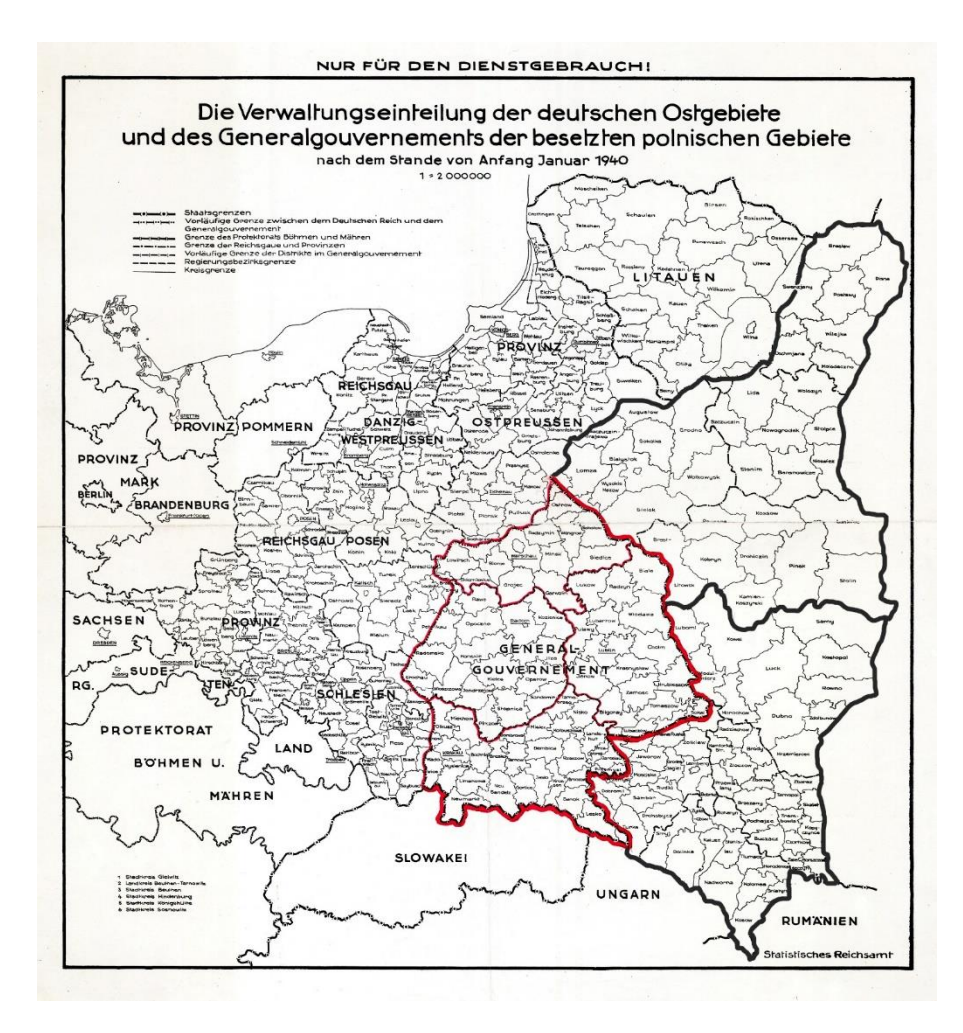
Fig. 5. Occupied Poland, January 1940. The map shows the Nazi-administered General Government (the area circumscribed by the red lines) and other Polish territories directly incorporated into the Third Reich. Polish territories annexed by the USSR are shown to the east and the northeast of the thick red line demarcating the border between Germany and the USSR. Western Ukraine (south) and western Belorussia (north) are situated between the thick dark red and grey lines.