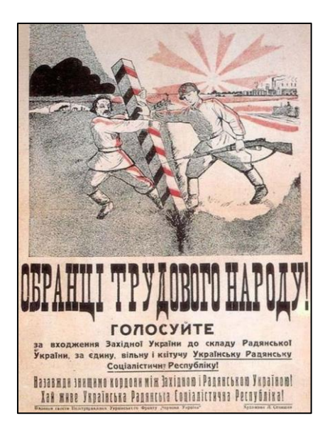
Fig. 2. Soviet propaganda posters. Left, 'Our army is the army of liberation of the workers. J. Stalin'; Right, 'Representatives of the working people! Vote for the union of Western Ukraine with Soviet Ukraine...', October 1939.

On 1 November a delegation from Lviv petitioned the Supreme Soviet, the rubber-stamp legislature in Moscow, for the incorporation of the occupied territory into the USSR. The next day, the same request was presented on behalf of western Belorussia. Predictably, both motions