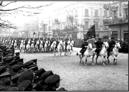
Fig. 1. The Red Army in Lviv. Left, Soviet troops examining captured Polish weapons; Right, the Soviet cavalry in a show of force, 28 September 1939 (still frame from a Soviet newsreel).

Red Army tanks appeared in the streets of Lviv in the afternoon of 22 September. Soviet troops entered Lviv in an orderly fashion, while the German units outside the city complied with the latest orders received