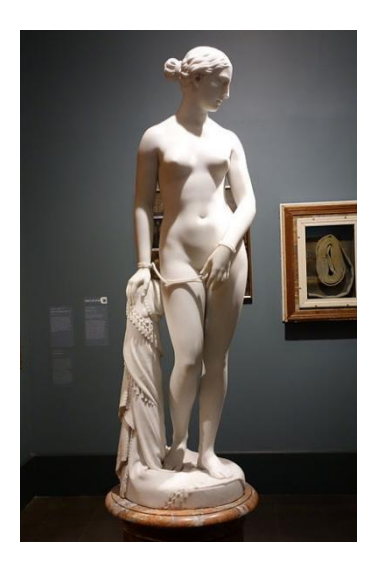
Figure 1: Hiram Powell, The Greek Slave , 1866, marble, 166.4 x 48.9 x 47.6 cm, Brooklyn Museum of Art. [CCO]. Image credit: <u>Daderot</u>.

plight of the white Greek slave to Black enslaved persons in the United States.<sup>12</sup>