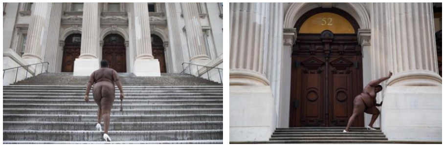
(L) Figure 9: Faustine, Over My Dead Body, 2012. Chromogenic photograph.

for the statue's removal and relocation to the New-York Historical Society. In They Tagged the Land with Institutions and Trophies from Their Conquests and Rapes , Faustine tries to destabilise a white hegemonic history by attempting to topple one of the columns at the entrance. The composition centres the old wooden doors that mark the entrance to City Hall between two of the white stone pillars (Figure 10). She uses her body to counterbalance the symmetry of the photograph. With her high-heel-clad feet placed on different steps, she leans in and pushes against the column on the right, seeming to strain against the futility of her efforts.