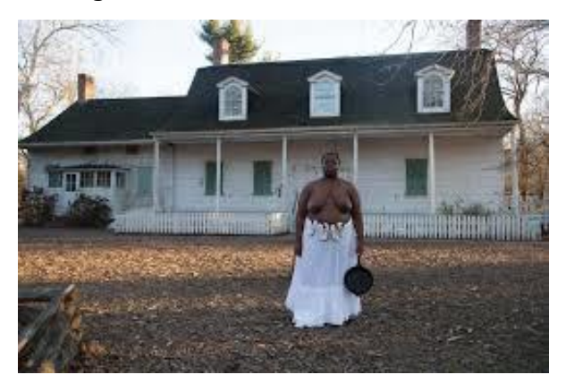
Figure 8: Not Gone with the Wind, Lefferts House, Brooklyn, 2012. Chromogenic photograph.

Faustine deconstructs the stereotype of the black, large-breasted houseslave wearing a kerchief to cover her nappy hair that was universalised through Hattie McDaniel's Mammy in the 1939 film Gone with the Wind . Gone with the Wind pivots around the affirmational relationship between slave and owner. The mammy figure was a nineteenth-century construction by white southerners in response to the antislavery moment in the north.<sup>36</sup> In minstrel shows they were broadly painted as asexualized figures happy, contented, and devoted to their white family. The idea of a mammy sought to redeem the relationship of white men to enslaved Black women in which Black women were sexually exploited for commercial gain. As 'Isabelle,' Faustine addresses the romanticized and distorted history of Black women as caretakers and nurturers. The black cast-iron pan in her left hand identifies her as a house 'domestic,' but she gives her mammy autonomy and authority. She has a name and thus an identity. She holds a steady gaze with the viewer. She reveals and claims her 'nappy' hair. White baby shoes are attached to the front of the skirt – signs of babies born into captivity to the financial benefit of the Lefferts family. It was only recently that the Lefferts House began to incorporate the history of those enslaved by the family into their publicfacing programs, the stark realities, as exemplified by Faustine, are still missing from the master narrative.