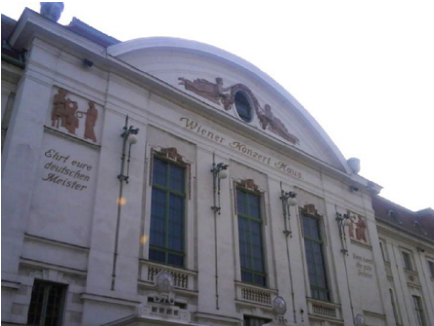
Side façade of the Vienna Konzerthaus , in secessionist neo-Baroque style, 1913. The motto (“Honour your German masters, and you will conjure up good spirits”) is a quotation from the fervently nationalistic final aria of Wagner’s Die Meistersinger von Nürnberg , 1868.

In looking for the demise of Romantic Nationalism in Europe, it is impossible to pinpoint an obvious, definitive cut-off point; and this presents an interesting asymmetry in comparison to its brusque, rapid onset. Instead, Romantic Nationalism follows, more or less, the long-tailed tapering-off curve of Romanticism itself as a cultural paradigm. It loses some of its monopoly in the second half of the 19th century; it undergoes some modified revivals in the fin de siècle ; it is sharply challenged by the advent of avant-garde Modernism around 1900 and by the trauma of the First World War. For practical purposes, this suggests a pragmatic terminus ad quem of 1919, but with an open eye to unexpected patterns of continued subsistence well into the 20th century.