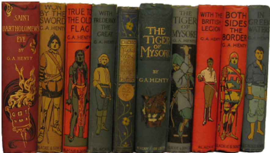
Late-19th-century historical novels and adventure novels for boys, celebrating nationality and empire.

The historical novel persisted longer in Central/Eastern Europe: Sienkiewicz's heroic-national Trilogy (1884-88) and Ivan Vazov's tragic-national Under the Yoke (1893) are still required school reading in Poland and Bulgaria, and although in Russia the historical novel went into decline after Puškin's Captain's Daughter , it was resuscitated in Tolstoj's War and Peace . Few people now read Scott; but War and Peace stays with us, not only through its own reprintings and translations, reaching new generations of readers and effortlessly meeting competition from newcomers, but also through the Hollywood movie starring Audrey Hepburn, or the BBC television series starring Anthony Hopkins, or the epic Soviet film ver-