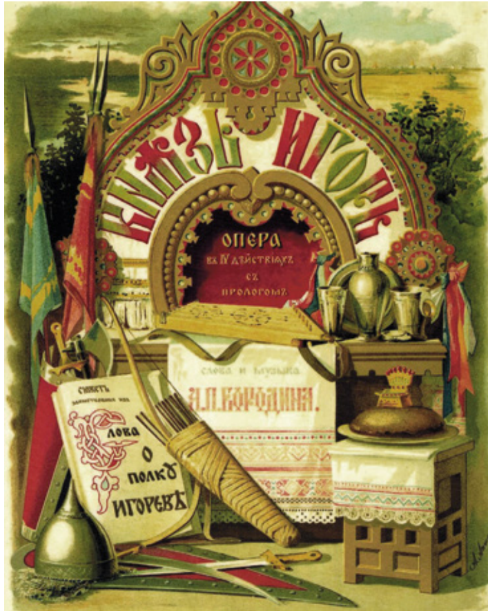
Title page of the orchestral score of Borodin's opera Prince Igor (1890). Featuring references to national music and literature (zither and epic text), and Russia's historical and folk-contemporary material culture.

When was Romantic Nationalism? Having hit Europe around 1800, it still, in some sense, is.