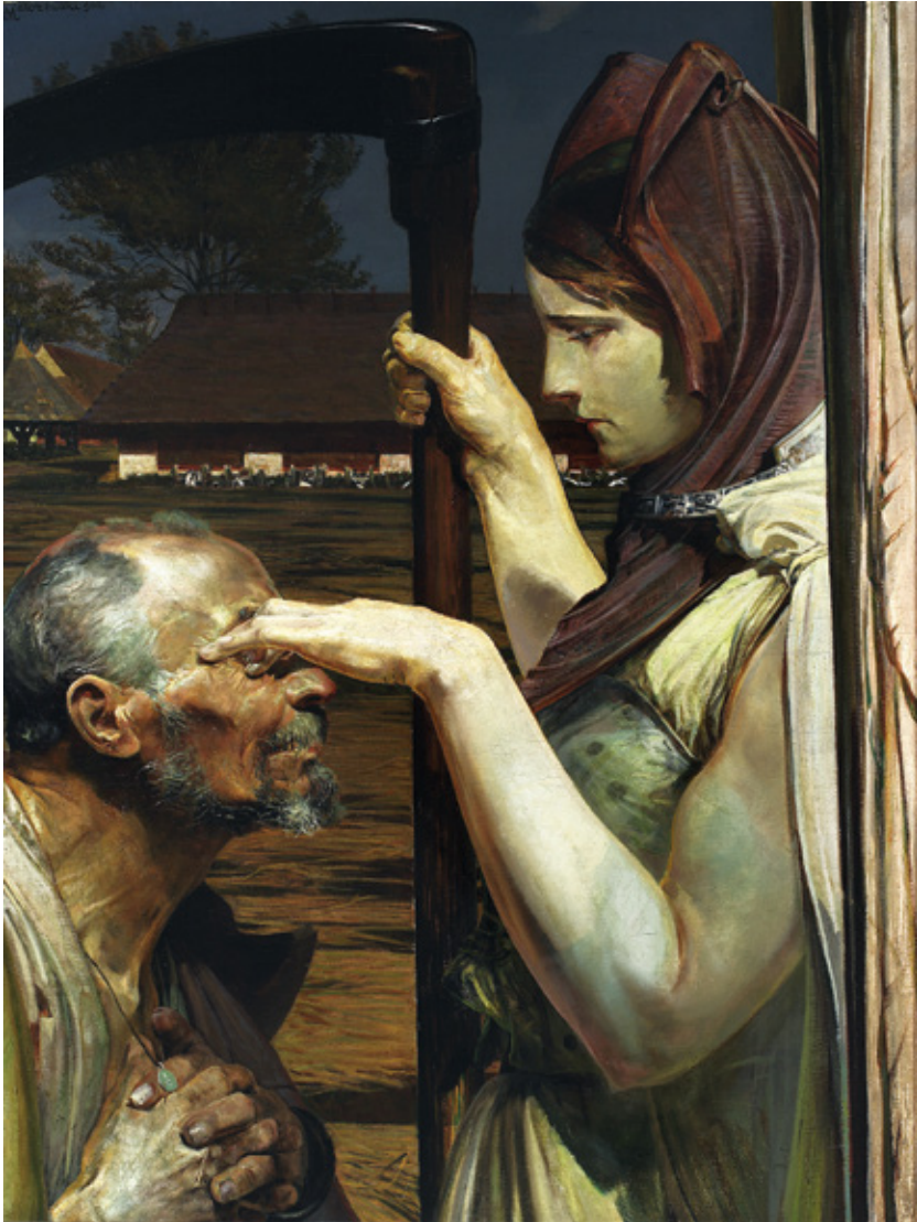
Jacek Malczewski, "Death" ( Śmierć ), 1902.

The painter uses his symbolist imagery in illustrating a scene from Juliusz Słowacki's poem Anhelli (1838), set among Polish political prisoners exiled to Siberia.