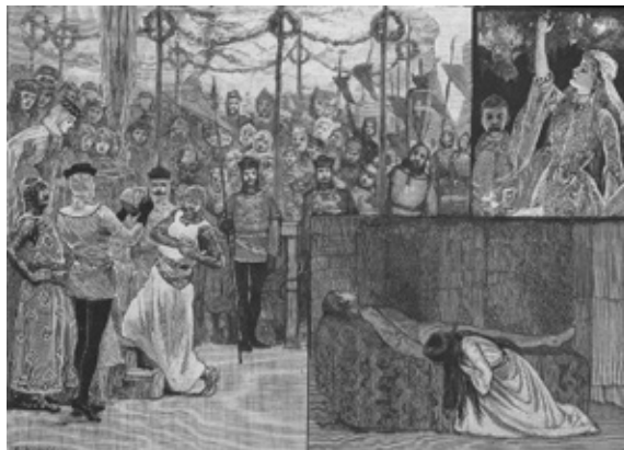
Scenes from Arthur Sullivan's opera Ivanhoe as depicted in the London Illustrated News (1891). They illustrate both the extraordinary multimedia 'afterlife' of Ivanhoe 's author, Walter Scott, and the last gasp of the genre of the national-historical grand opera.

persistence of the Old. Vaughan Williams in his later Fantasia on Greensleeves (1934) re-activates his celebration of idyllic Englishness by means of stylistic gestures taken from the native-musical repertoire, and in the Mann or the Yeats of the late 1930s we still recognize elements from their early work: an ongoing preoccupation with the condition of Germanness or Irishness. Manuel de Falla, driven into Argentinian exile (1939-1946) by Franco's seizure of power, continued his work on the opera Atlántida , based on Jacint Verdaguer's 1877 Catalan epic, almost as an act of resistance (or non-compliance). There is no unidirectional, irreversible transition from Romantic Nationalism into non-National Modernism: and this cuts across the simple idea that the advent of Modernism, though staggered over different moments, marks a clear cutting-off point putting an end to what had been there before. Although Modernism, and the rejection of Romanticism, becomes dominant, it never establishes total dominance, and in the tapering-off of Romantic Nationalism we see intriguing patterns of subsistence, a flickering of momentarily re-kindled embers from underneath the ashes, a continued presence in remote and unsuspected corners.