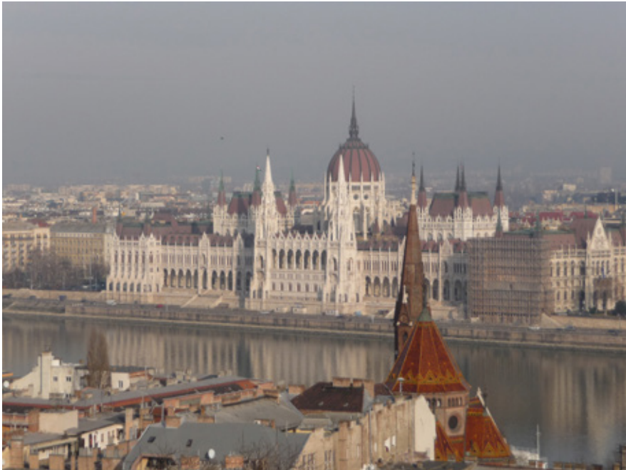
Hungarian parliament, Budapest, built 1896-1904. Neo-Gothic proclamation of the nation's historical rootedness.