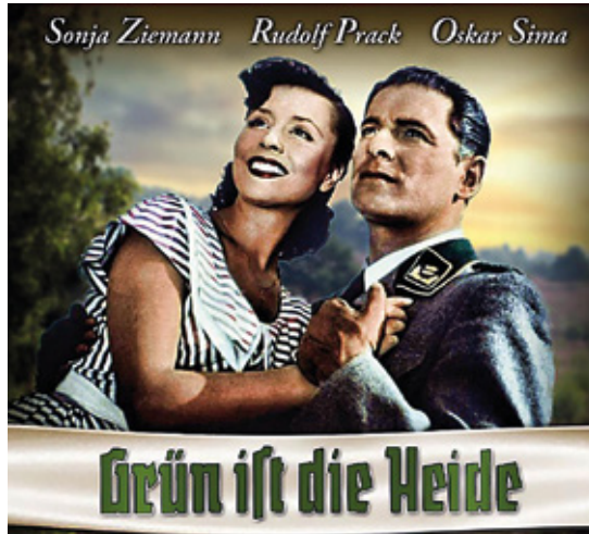
Grün ist die Heide ("Green is the Heath"): rustic-idyllic Heimatfilm by Hans Deppe, 1951 (remake of 1932 original), on motifs by Hermann Löns.

Is there a cut-off point here, and if so, where precisely? Can one claim in so many words that Vasilij Grossman's Life and Fate , or Edgar Reitz's Heimat , are examples of Romantic Nationalism as much as Puškin's Poltava or Wagner's Meistersinger ? Surely not; yet on the other hand, there is a tradition linking them, marked by half-way houses such as War and Peace or Hermann Löns' Der Wehrwolf . Ignoring