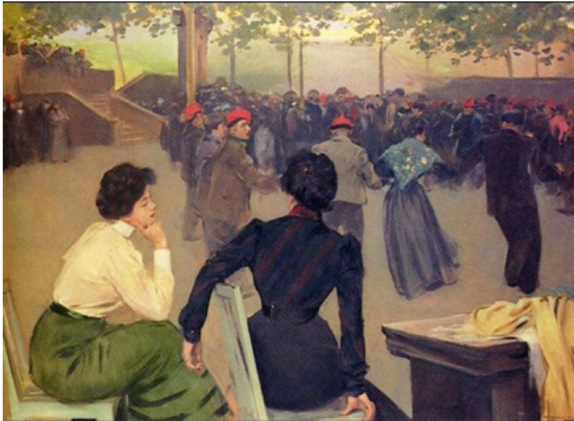
Ram3n Casas i Carb3, "Dancing the Sardana at the San Roc Springs, Olot" ( Sardanas en la fuente de Sant Roc de Olot ), 1901. Note the wearing of the national barretina headgear.