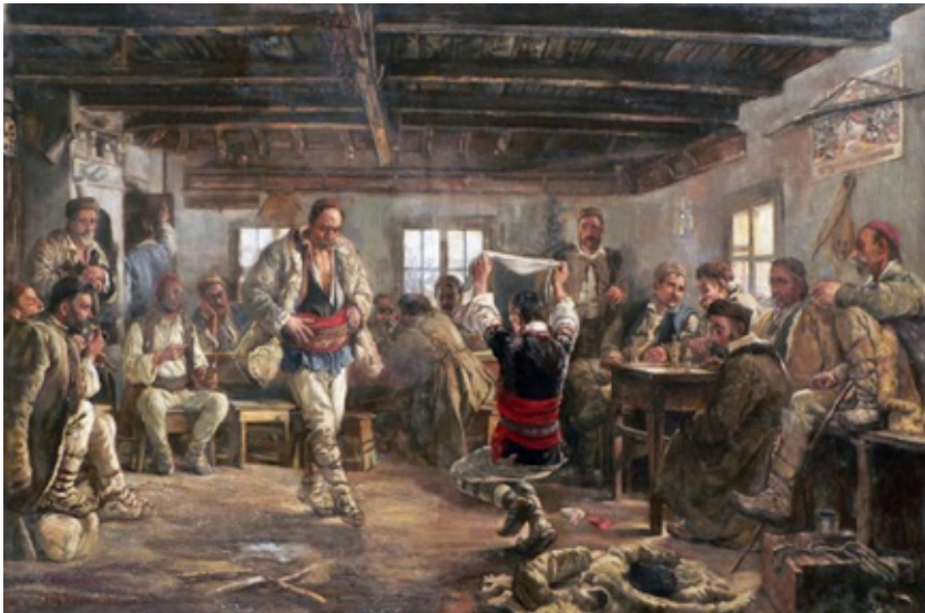
Ivan Mrkvička, "Dancing the Răčenica" ( Răčenica ), 1880s.

The Czech-born painter (1856-1938), trained in Prague and Munich, and settled in Bulgaria since 1881, represents the important Czech influence, pan-Slavically inspired, on Bulgarian artistic life. He took inspiration from Bulgarian folk life and was one of the founders of the country's National Academy of Arts.