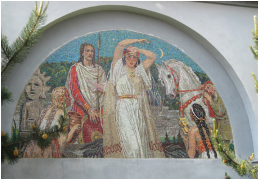
“Libuše foretelling the glory of Prague” ( Kněžna Libuše věští slávu Prahy ).

A Romantic legendary trope recycled in socialist Czechoslovakia. This 1950 mural in the Octárna Hotel (Kroměříž) was designed by Max Švabinský (1873-1962); he had produced symbolist nationalist work from the early 20th century on.