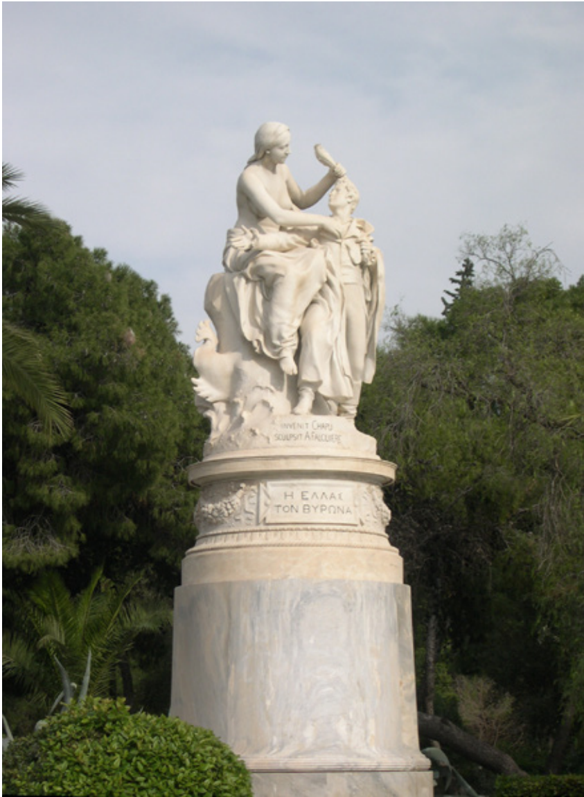
Byron statue in Athens by Henri Chapu / Jean Falquière, 1895.