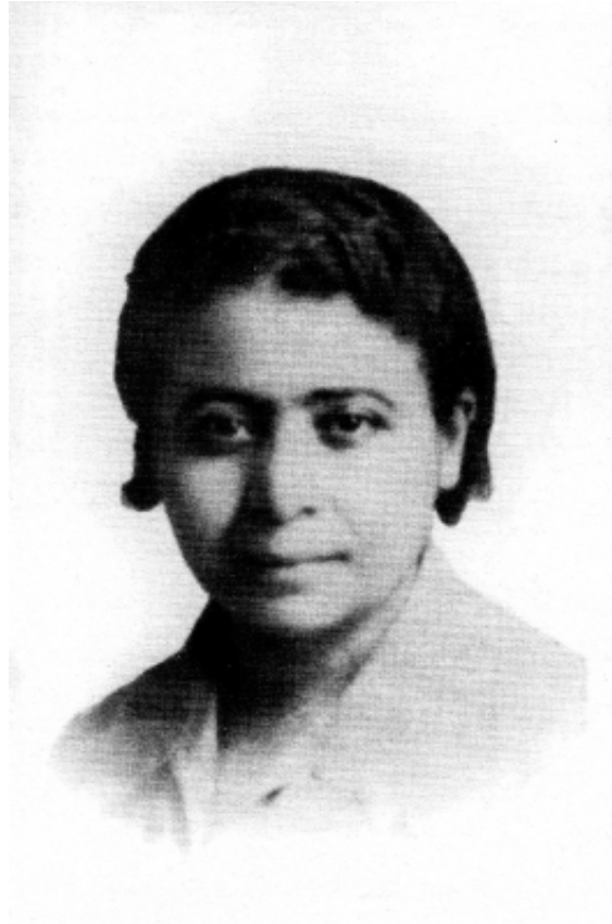
Fig. 5 Mārī 'Ajamī (1888–1965). Reprinted from Jihā, Mārī 'Ajamī , p. 294.

'owner' ( ṣāhibatuhā — the term typically used for the journal editor), as she continued to contribute substantially to Mīnarvā . Overseas, she wrote for the Arabic press in Chile and Brazil and pursued cultural activities promoting Arabic literature and culture in the Southern mahjar , the Syrian diaspora in South America.