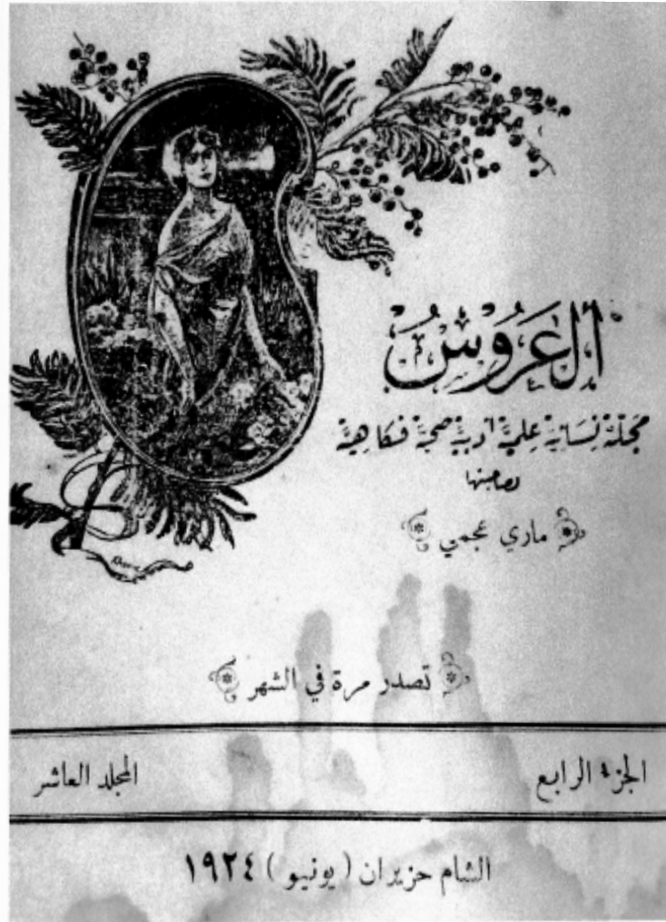
Fig. 1 Cover page of al-'Arūs , 10.4 (June 1924). Reprinted from Zerouali, p. 67.