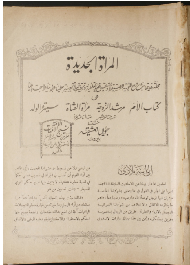
Fig. 7 Masthead and ornamented title of editorial ‘To my homeland’s daughter’ (‘الى ابنة بلادي’), of al-Mar’a al-Jadida , 3.9 (September 1923), n.p. [p. 305]. Bibliothèque Orientale, Saint Joseph University of Beirut, Lebanon, call number: 184F4/183D2.