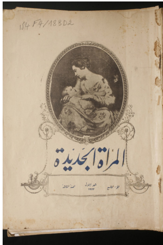
Fig. 3 Cover page of al-Mar'a al-Jadida , 3.9 (September 1923). Bibliothèque Orientale, Saint Joseph University of Beirut, Lebanon, call number: 184F4/183D2.