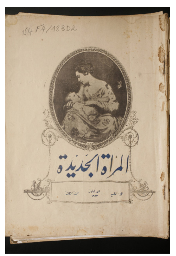
Fig. 3 Cover page of al-Mar'a al-Jadīda , 3.9 (September 1923). Bibliothèque Orientale, Saint Joseph University of Beirut, Lebanon, call number: 184F4/183D2.

Fig. 2 Title page of Minarva, 1.1 (15 April 1924). Bibliothèque Orientale, Saint Joseph University of Beirut, Lebanon, call number: K/382.