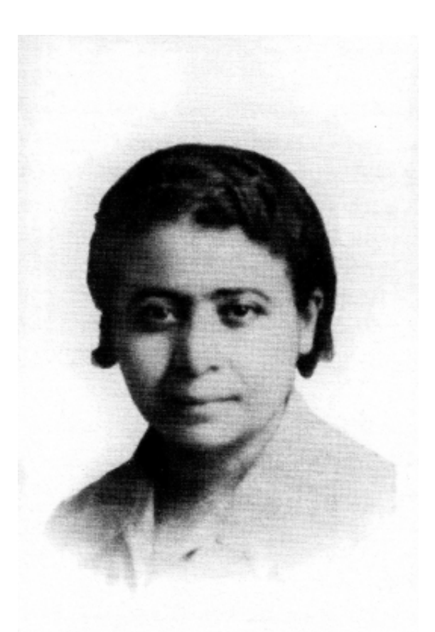
Fig. 5 Mārī 'Ajamī (1888–1965). Reprinted from Jihā, Mārī 'Ajamī, p. 294.

'owner' ( şāḥibatuhā — the term typically used for the journal editor), as she continued to contribute substantially to Mīnarvā . Overseas, she wrote for the Arabic press in Chile and Brazil and pursued cultural activities promoting Arabic literature and culture in the Southern mahjar , the Syrian diaspora in South America.