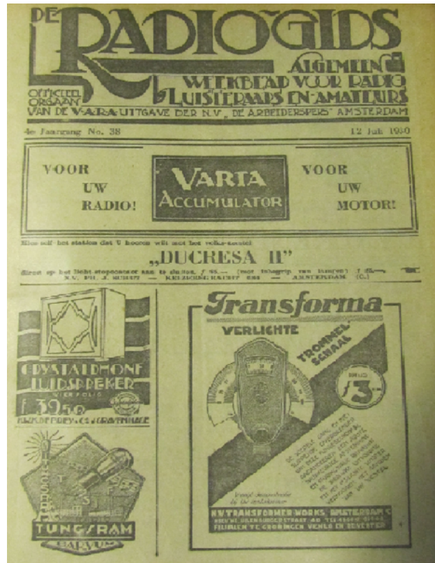
Fig. 1 Cover of De radiogids (12 July 1930)