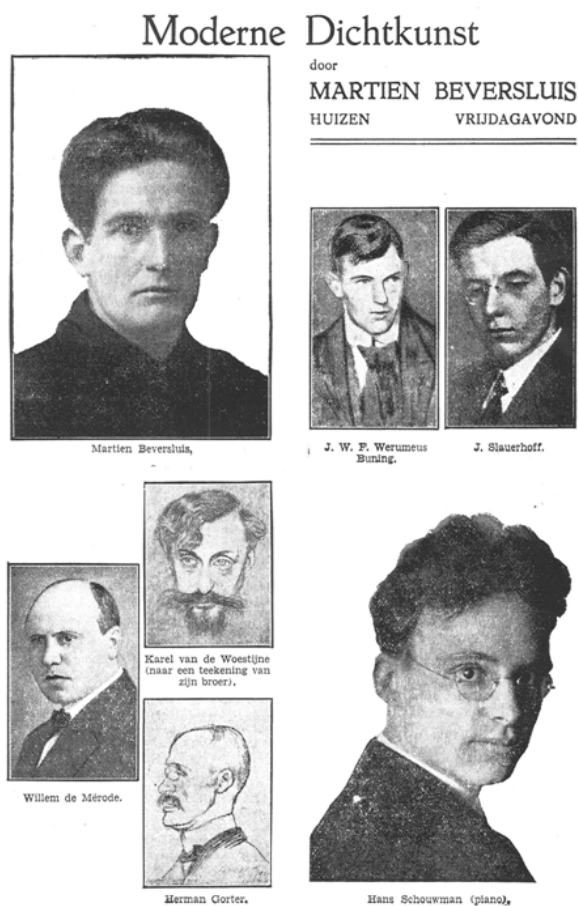
Fig. 3 Advertisement for the VPRO programme 'Moderne Dichtkunst', Radio , 2.45 (1928), p. 14

for his novels about the village boy Merijntje Gijzen, but also the leading literary critic of the socialist newspaper Het Volk . On 23 July 1930, Het Volk reported positively on De Jong's appointment at VARA: 'Now that such a well-known author like De Jong enters into service, the labourers' broadcaster in general — regarding the artistic part of its work — and De Radio-Gids [sic] in particular will gain success. Hence, the enthusiasm of the many listeners is understandable'. 25