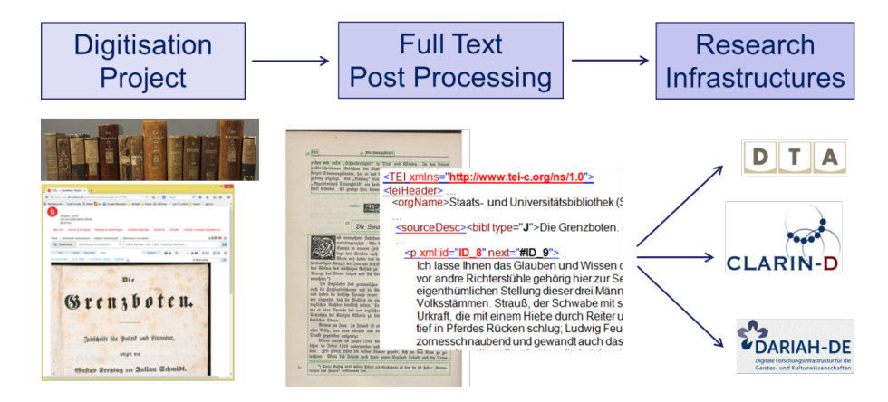
Fig. 1 Transfer of full text from a finished digitization project to research infrastructures

cooperation with our partners, the DTA. Using this structure information, we converted the OCR output format to an interoperable Text Encoding Initiative (TEI) format.