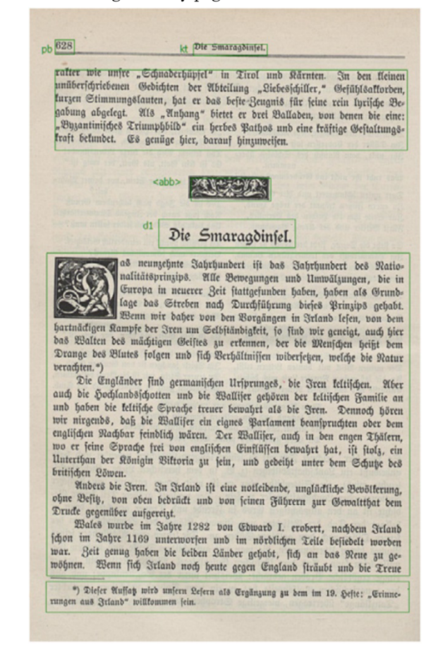
Fig. 7 'Zoning'— adding structural annotation

of this step is the computation of term frequency: to avoid overestimations, terms in running headers, reoccurring on every page, should not be counted.