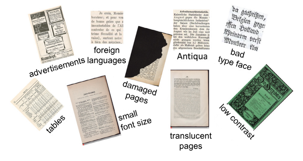
Fig. 3 Sample results of an automated quality assurance using OCR full text

The next section will discuss quality issues of the full text, which fundamentally depends on the typeset and of course on the quality of the scanned images. Fig. 3 shows that we were able to automatically identify problematic pages such as advertisements (having diverse layouts and typesets), tables and pages containing foreign languages, Antiqua type, or low image quality (low contrast, bad type face, small font size, translucent and damaged pages).