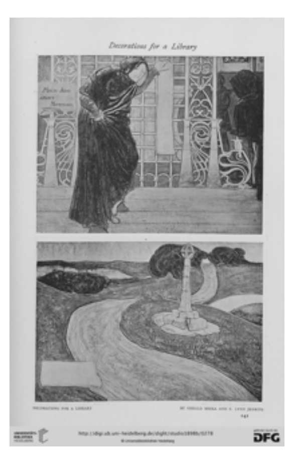
Fig. 1 Gerald Moira and F. Lynn Jenkins, 'Some Decorations for a Library', The Studio , 14.66 (September 1898), 241

had formed, which by 1910 had its own networks, galleries and careers—and its own periodicals.