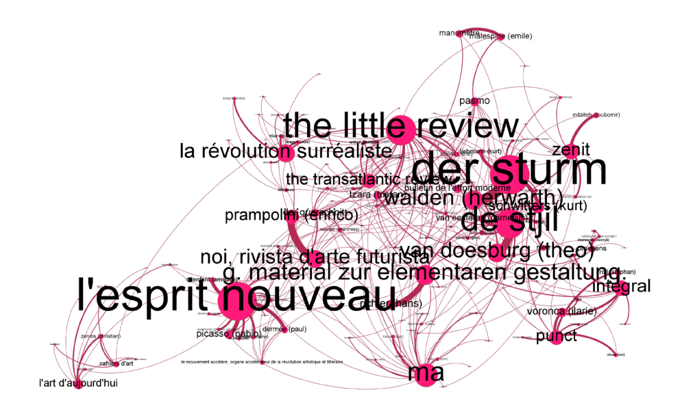
Fig. 4 Network Analysis of the content of 25 modernist magazines from 1924 to 1926. Sharing Names (artists illustrated, and authors of the articles published). Sources: see note 47

was the only magazine to maintain real contact with other regions across the globe. This analysis is further supported when we look at the authors published in magazines. Three distinct avant-garde incubators can be identified. The first network, consisting of constructivist magazines, is a central European one, structured around G , De Stijl , L'Esprit Nouveau , MA , and magazines linked to Der Sturm: Zenit (Zagreb, 1921–26), Noi (Rome, 1917–25), Punct (Bucharest, 1924–25), Integral (Bucharest, 1925–28). A second network was composed of magazines of École de Paris dealers and focused on the French capital ( Bulletin de l'Effort Moderne , L'Art d'Aujourd'hui , Cahiers d'Art , Der Querschnitt ). Our third and final avant-garde network was sparsely, if at all, connected to other international avant-garde, whose key titles were Littérature and La Révolution Surréaliste (a rather isolated avant-garde which is wrongfully considered today as the global dominant art innovation during the period).