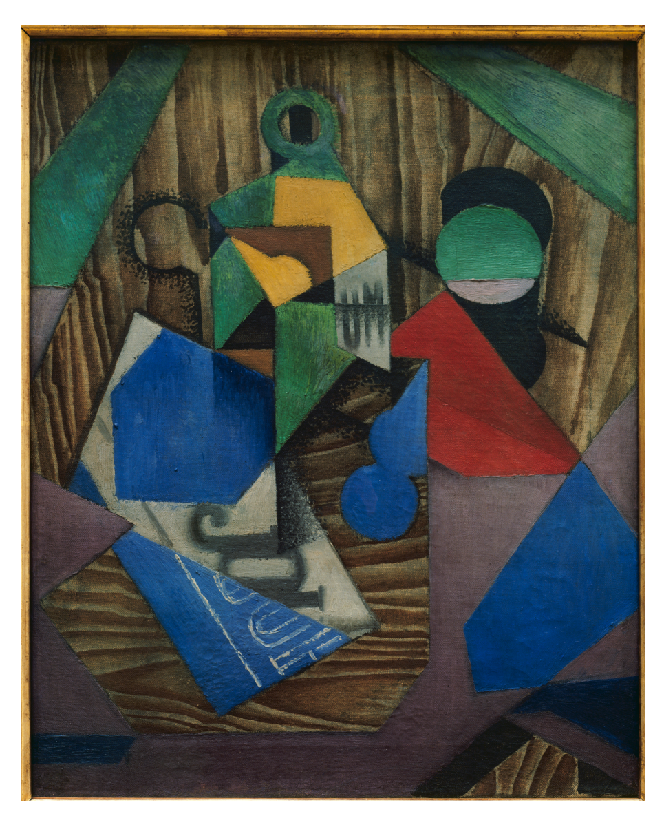
Fig. 2 Juan Gris (1887–1927), Bottle of Rhum and Newspaper , 1913–14, oil on canvas, 460 x 370 mm. London, Tate Gallery

Turpin encouraged artists to 'spread articles promoting one's work, working, if necessary, with translators' in 'the foreign centres most sought after by modern artists from all countries' — namely Berlin, Munich, Leipzig, Sweden, Norway, Warsaw, Vienna, Liège, and Brussels, Amsterdam, Leningrad and Moscow, Romania, Prague, Rome and Venice, Madrid, Valencia and Barcelona, Geneva, London, Edinburgh, Tokyo, and in America, the 'field' extending from 'New York, Saint Louis, Chicago, Boston' to Cincinnati, without neglecting 'the South American republics and the countries of central America [...] very interesting territories for (French) artists as they have long been primed for their arrival by French literature.'<sup>36</sup>