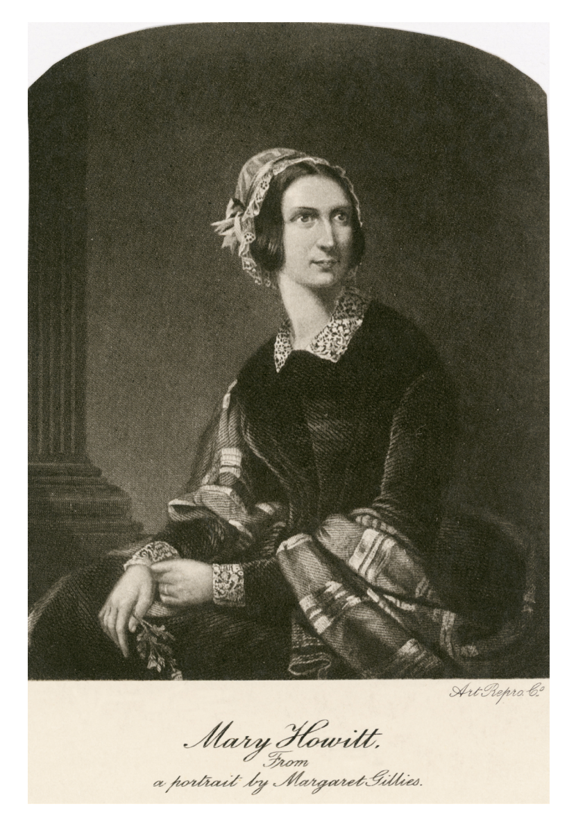
Fig 2 Mary Howitt (1799–1888).

her Autobiography she indicated that her role was mainly to write poems to accompany the engraved plates supplied by the publisher, so her practical experience may have been limited. But it is highly likely that as the Journal was run on a shoe-string she had a hand in layout and proof reading.