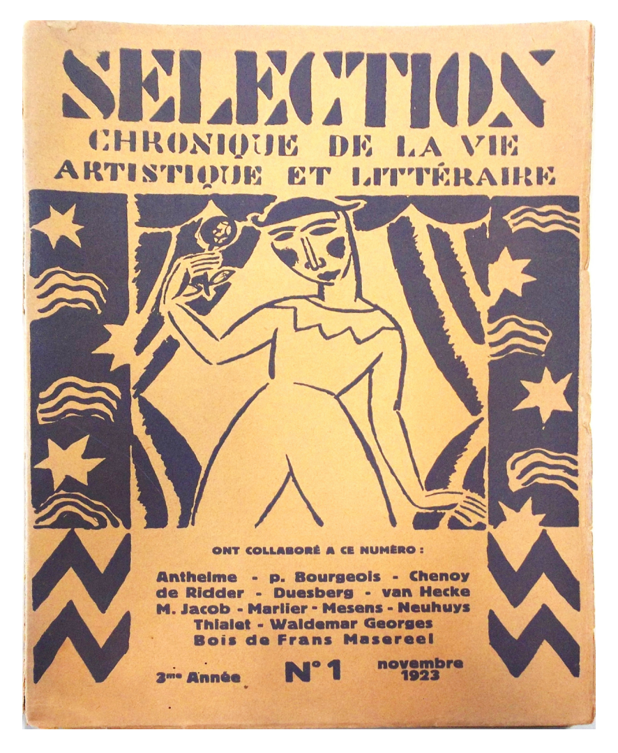
Sélection, no. 1 (November 1923). Cover by Gust de Smet Fig. 2

Belgium or abroad. Having announced the intended publication of at least twentytwo Cahiers Sélection, the editors eventually published only fourteen booklets before the discontinuation of the magazine in 1933.<sup>10</sup> In the meantime, Sélection published a series of Tracts, mainly consisting of opinion essays on contemporary art by regular contributors to the magazine, such as the French art critic André Salmon, its general secretary Georges Marlier, and the two editors. Each of the three phases of Sélection carries its own significance and goes hand in hand with the activities of Van Hecke and De Ridder as well as the changes in economic status that they faced throughout its publication. The second phase could be seen as the apex of its reputation and success. The third phase is marked by financial difficulties accompanied by Van Hecke's leaving. Sélection's price was doubled from 3,50 frs to 7 frs in 1928 to balance the expense of its publication when profits were meagre.