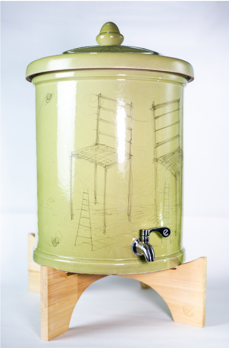
Figure 5. Ecofiltros painted by Guatemalan graffiti artists