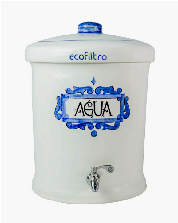
Figure 4. Urban Areas Ecofiltro