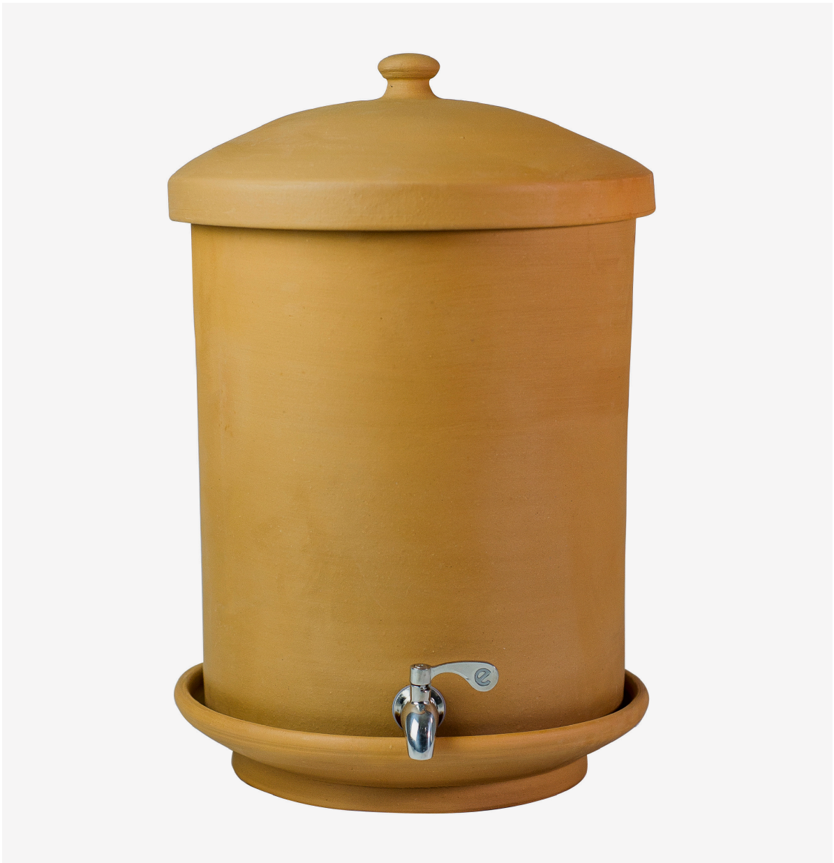
Figure 3. Ecofiltro