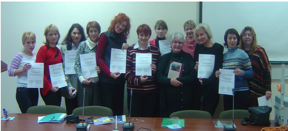
Figure 4: Participants of the PSYCON workshop with their certificates

Many of the conferences were attended by researchers from outside the Ukraine: