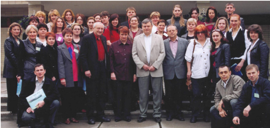
Figure 3: Participants of the ENOP International Workshop