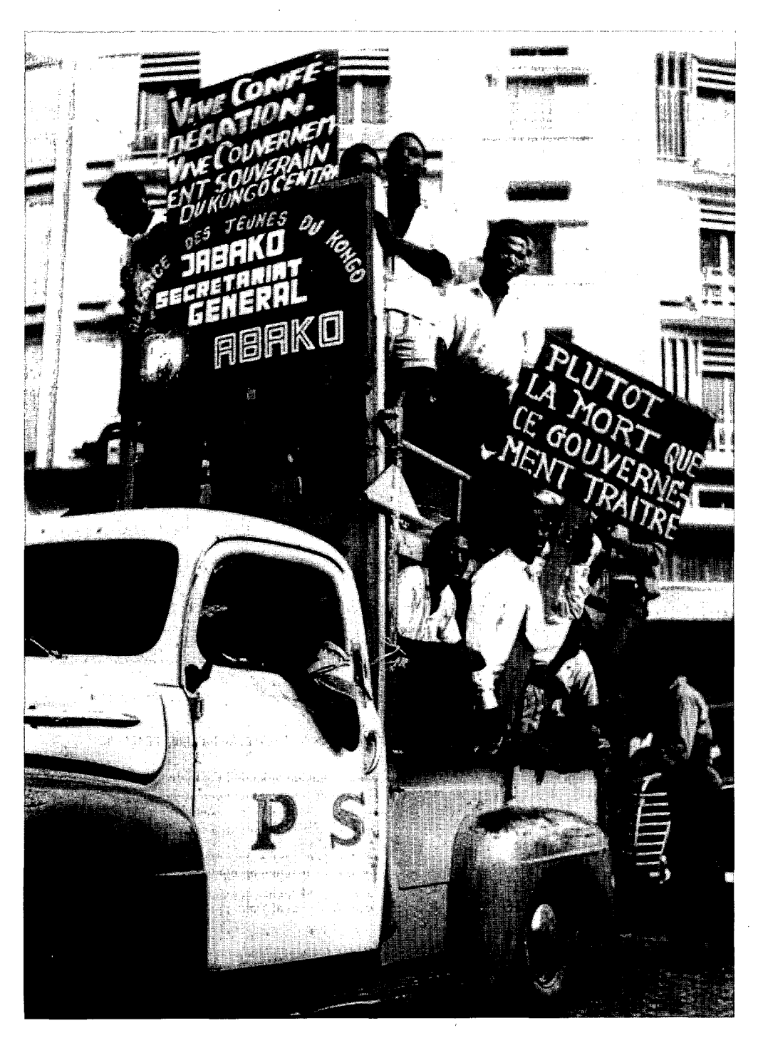
Anti-Lumumba manifestation organised by Abako in August 1960