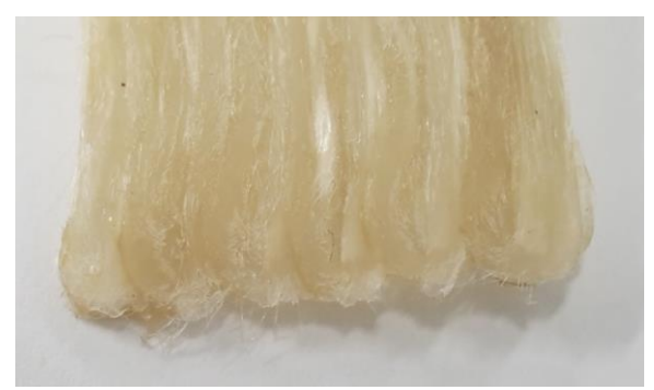
Figure 3. Tow pullup in regions of high path curvature.