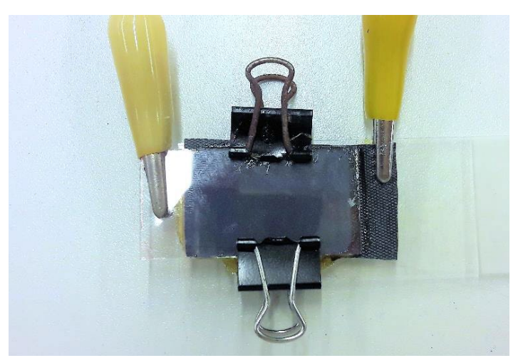
Figure 2. Hybrid glass/textile dye sensitized solar cell with hibiscus dye and Tubicoat ELH polyester fabric as counter electrode

The best dye in all cases was the hibiscus extract. The other dyes resulted in lower short-circuit currents. With the other counter electrode materials, also lower short circuit currents are obtained.