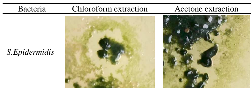
Figure 2. Antibacterial activity of algae powder after chloroform and acetone extracts against S.Epidermidis .

The antibacterial activities of powders were tested and compared depends on the nature of the solvent. Each chlorellin powder was first characterized alone by agar diffusion test on two types of bacteria: a gram + ( S.Epidermidis ) and a gram - ( E.Coli ). For example, the antibacterial activity against S.Epidermidis is illustrated in figure 2. The halo means no bacteria development around powders.