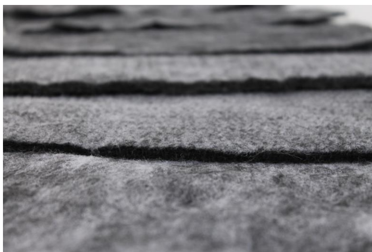
Figure 1. Hybrid-nonwoven, consisting of rCF and PA6

A very efficient way to use the recycled carbon fibres is to process them into a nonwoven. Nonwovens can be used to reinforce semi-structural composite parts. When the matrix of the composite consists of thermoplastic materials (in this case PA6), these materials can get mixed into the recycled carbon fibres, to create a hybrid-nonwoven. In figure 1 a hybrid nonwoven is shown.