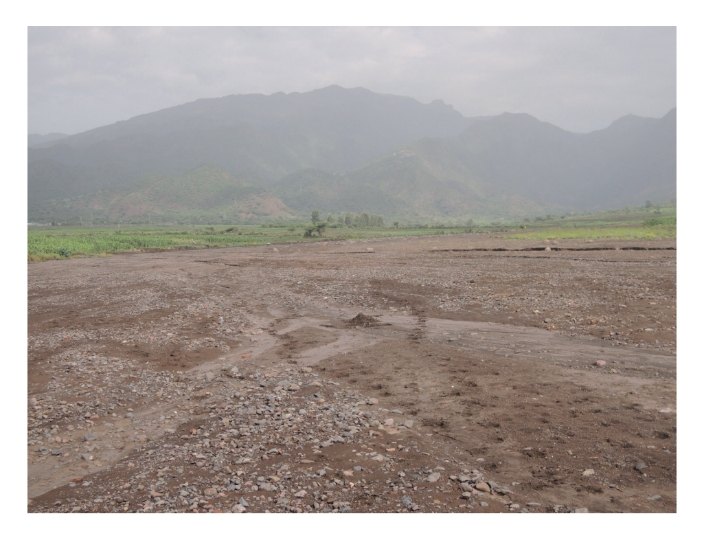
Figure 1: The western steep escarpments (at the back of the photo) and the gentle graben bottom in which the ephemeral river drains (at the middle and front of the photo) in the Raya graben. Hara river (August 2013)

The marginal grabens in the northern branch of the Ethiopian Rift Valley are typical semi-arid depositional basins onto which several ephemeral rivers draining the graben shoulders transfer large quantities of sediment through the main river stems and wide distributary systems (Biadgilgn et al., 2016). They are characterized by steep escarpments and gentle graben floors (Fig. 1). As depositional basins characterized by flash floods and dynamic rivers (in terms of morphology) draining into it, there are social and environmental problems that prevail. Due to flooding, the destruction of settlement areas (villages and towns) and farmland is frequent. Besides, the conversion of cropland into sandy flood plains, active channels, and shrubland creates situations leading to parafluvial and orthofluvial belts along rivers (Lorang and Hauer, 2006). The parafluvial landforms consist of areas of the floodplain that are frequently flooded at near bank full stage and are dominated by scour, erosion and bedload deposition, whereas the orthofluvial landforms are characterized by plant succession (e.g., grasses and shrubs) and are inundated by annual flood events.