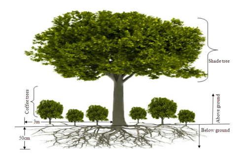
Figure 1: A sketch of shade tree and understory coffee plants

The present study was therefore initiated with the following objectives, to (a) quantify and identify spores of AM fungi occurring under the different shade tree species, and (b) investigate the relationship between AM fungi, root colonization, and physical and chemical soil parameters in a number of natural coffee forest sites in Bonga, Ethiopia, where some natural forest relics are found.