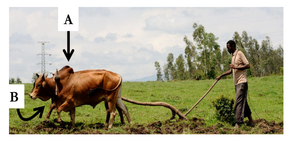
Figure 1. Zebu oxes ploughing the land at the Gilgel Gibe catchment, Ethiopia. A = hump, B = cossum.

with an adjacent reservoir and dam on human and animal health, ecology and agronomy, in order to improve the life quality of local communities. Here, farmers subside on mixed farming systems (Moti et al. , 2012) and cattle are reported to be mainly of the indicine Guraghe-type (DAGRIS, 2007). Herds of such cattle are typically free-ranging on poor pastures. In and around Jimma, the largest city in the area, urban dairy farming is commonly practiced. Most cattle on these rather small farms are crosses of local zebu and Holstein Friesians. The animals are kept on a zerograzing regime with a cut-and-carry feeding system for forages, fed in combination with concentrates and by-products (Belay et al. , 2012).