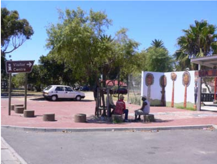
Figure 14: Signage on the street side of Guga's Thebe indicating the main function of the center

the same time designed to make full enclosure of the building (an absolute necessity in the townships) possible. As a result, the intended ambiguity between inside and outside space is partially lost because it has had to give way to security issues. Hence, despite the abundance of both direct and indirect references to the typical history and spatiality of Langa, the S'Thebe (platter) metaphor seems to succeed primarily in terms of its social ambitions, bringing people from different generations and backgrounds in the community together to practice and transmit local arts and crafts knowledge. In spatial terms, however, the project could be read as a projection of a future condition, or material representation of hope and expectation.