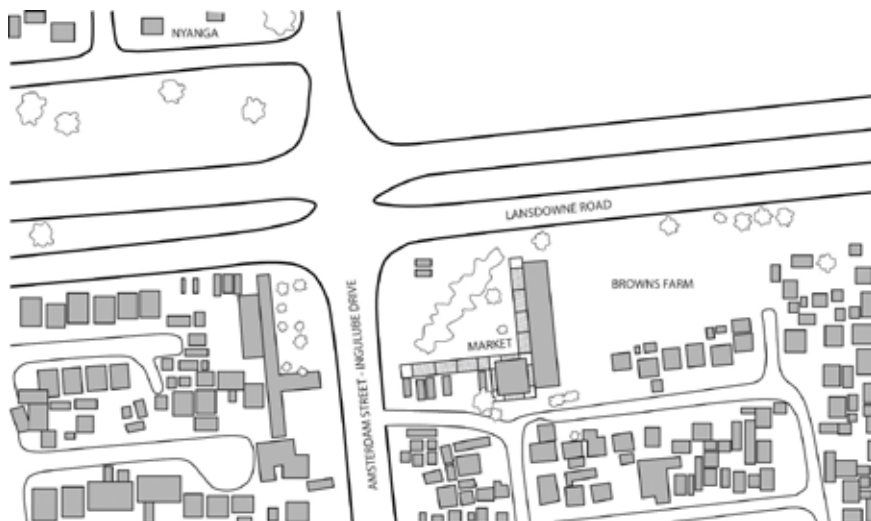
Figure 2: Site plan Browns Farm market with containers to the rear sides (schematic drawing by the author)