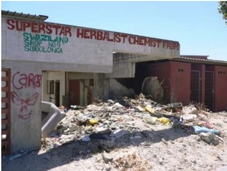
Figure 10: Knuckle of the structure intended as public living room