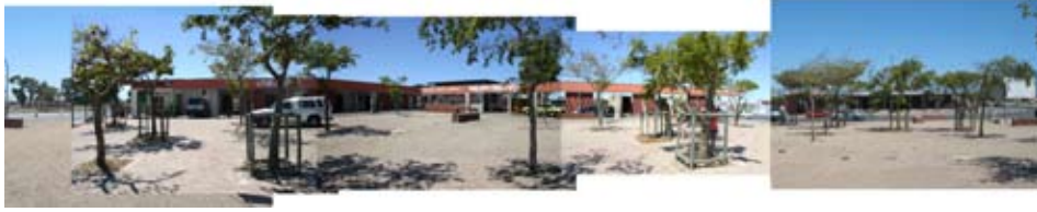
Figure 12: Collage showing the tentative appropriation of the Browns Farm building in 2010 (photographs and manipulation by the author)