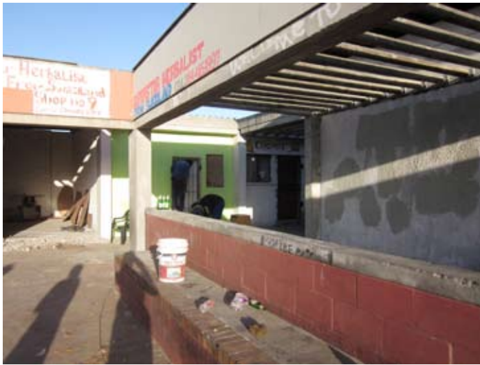
Figure 13: Gradual development of the units around the knuckle (September 2011)

Guga S'Thebe, on the other hand, has since its completion in 1999 enjoyed a reasonable level of success in terms of achieving the promoters' and designers' initial intentions, having become an important tourist attraction 24 in the Cape Town region. The building is very well maintained and benefits from a well functioning organizational board. In part this may well be due to the intensive involvement of the community throughout the different stages of realization, empowering them to a certain degree in the positive development of their built environment. In spatial terms however, this building comes across as a metaphorical white elephant, standing out sharply within the poor township tissue. This effect is further enhanced by the man-high garden wall which, metaphorically, had to evoke township spatiality, but in fact reinforces the sense of seclusion as it was at