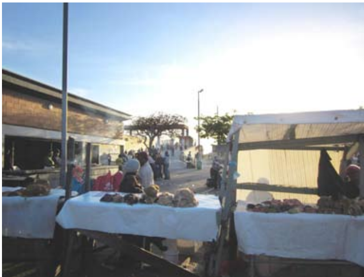
Figure 11: Philippi Station DPP project; also by Du Toit & Perrin Ass. The colonnade has contributed to the arising of a clearly demarcated, dense node of activity around the station. Informal activities like street trading, children playing and youngsters gathering have capitalized on this public presence and appropriated the 'infrastructural' equipment of the public plaza.