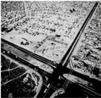
Figure 9: Birds eye perspective Browns Farm market structure (photograph: courtesy of the architect)

Hence, although it is presented as social infrastructure, there is more to this apparently modest structural operation than the architectural discourse leads us to believe. Figure 9 illustrates that the shape of the building and the way the grid delineates this new 'place' are not gratuit . This is not self-evident, as up until the abolition of apartheid, there was no official vision of how a sense of identity could be generated through public space and the built environment in the townships. The design strongly relies on the rhythm of