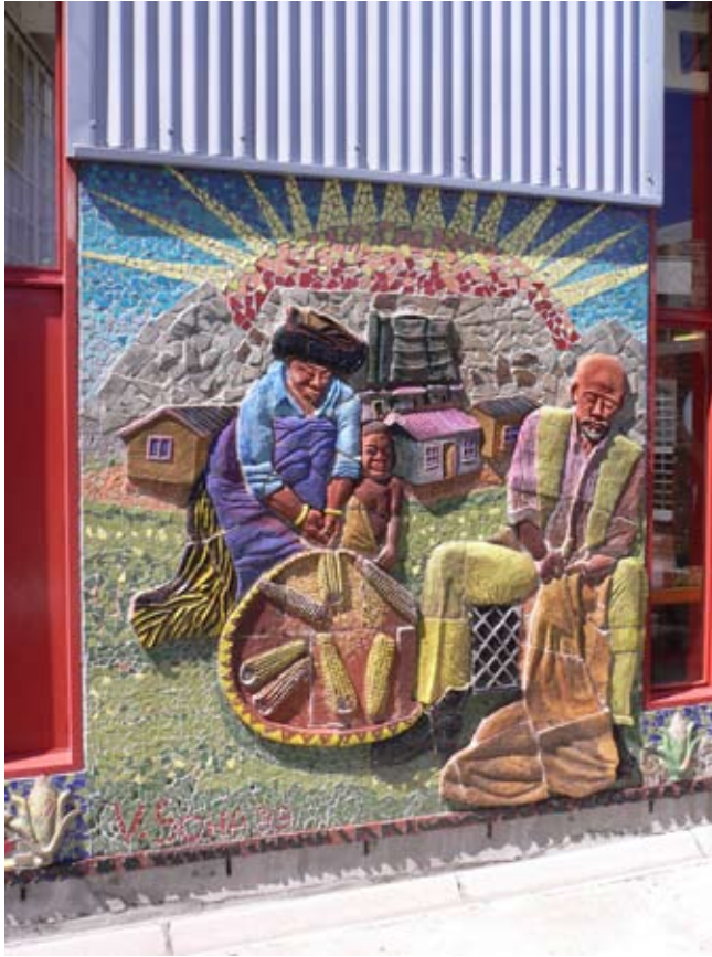
Figure 8: Ceramic mosaics on the "garden wall" and in the semi-public forecourt

As part of CS Studio Architects' usual design strategy, the architects wanted community involvement to be central to the realization of this project 20 . An important aspect in this respect was the design and implementation by local artists of ceramic mosaics which can be found in different parts of the building. According to Smuts, these mosaics project the memory of the community and tell the story of Langa, the modernization of the townships, the importance of music and dance and the different arts and crafts, again stressing the S'Thebe metaphor (Figure 7 & 8). The architects thus use a highly meta-