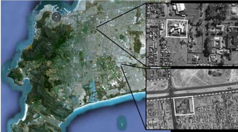
Figure 1: Satellite image of Cape Town with city center and location of two projects indicated (satellite images: Google Maps manipulated by the author)