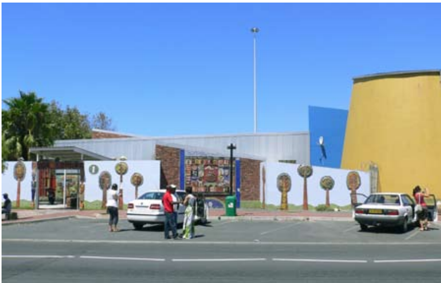
Figure 7: Ceramic mosaics on the "garden wall" and in the semi-public forecourt