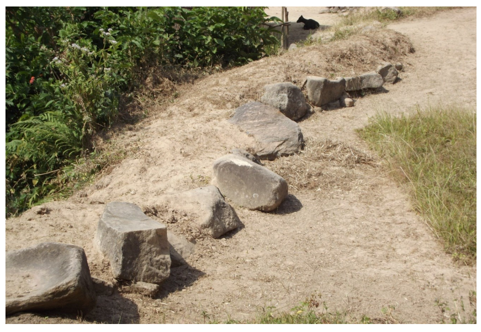
Figure 3: Some Ngohtebeh (Camwood Grinding Stones) Bu, Cameroon.

to rub men who were admitted into the Tschong (friction drum) society. <sup>17</sup> This was also a society of mettle among the Laimbwe notables some of whom were also members of the Kuiifuai regulatory society. Camwood was therefore used not only to decorate these men of honour within the traditional society but it was also used to give authority to those who became members of the highest decision making institution in the village.