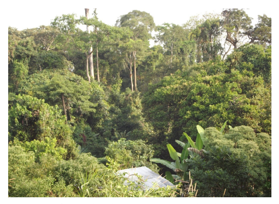
Figure 1: Northern view of the Krehke'azheh (Kezheh Forest) Bu, Cameroon (Source: author's collections 2012).

According to oral and historical narratives with regard to the founding and activities of Bu people in the Krehke'azheh or Kezheh forest, aspects of their history are brought to light but which have never been found in the available literature on Laimbwe history in libraries. Such aspects include environmental, health, conflict, lineage and political history of the Laimbwe people.