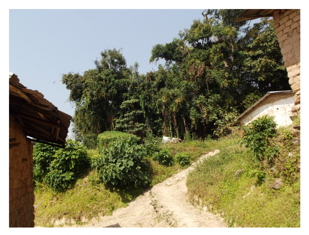
Figure 2: Partial view of the Kuiifuai Forest, Bu Cameroon (Source: author's collections 2012).

lineages define and oversee the implementation of policy in the village. In fact, members of Ikuum, the apex lodge of the Kuiifuai regulatory society are power brokers in village administration (See Plate 2 for the Kuiifuai forest).