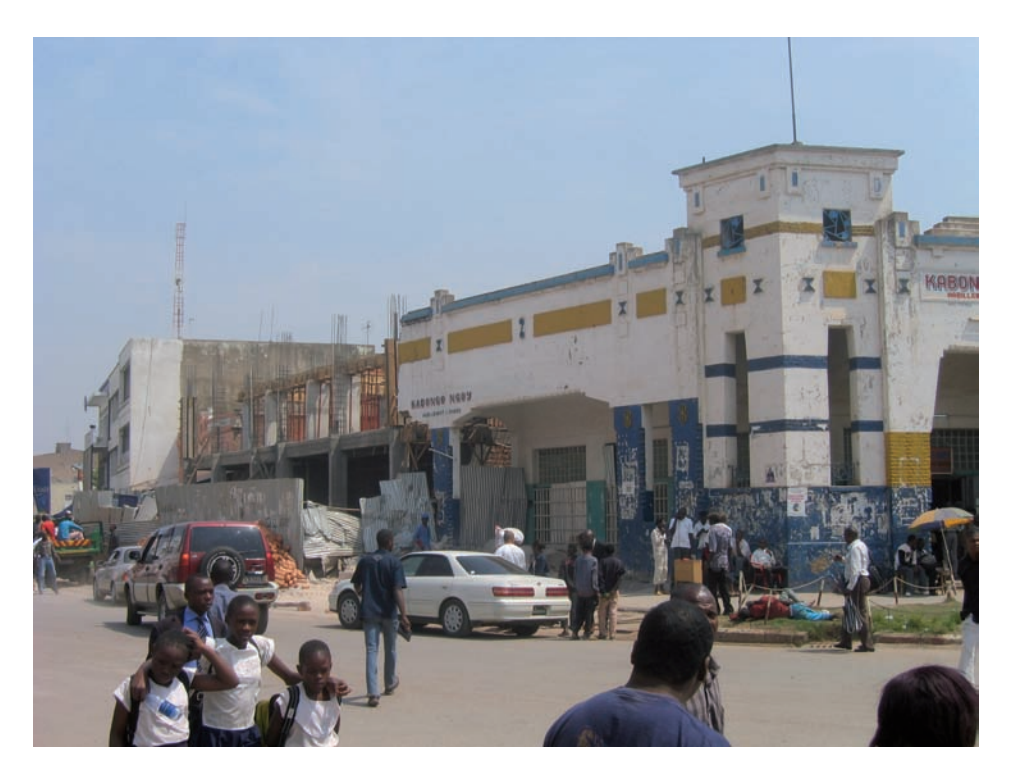
Fig. 1: Demolished 1920s building in the city centre of Lubumbashi, (photograph Serge Songa-songa, 2007)

On February 2nd, 2005, the eve of the day on which the Royal Museum of Central Africa in Tervuren was to open its major exhibition Memory of Congo. The colonial Era, a curious event occurred in Kinshasa, the capital city of the Democratic Republic of Congo. The equestrian statue of King Leopold II that had been lying in a warehouse on the