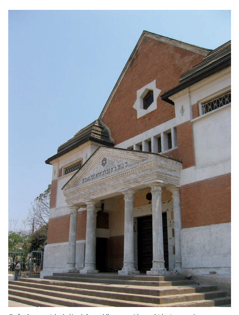
Fig. 6: Synagogue, Lubumbashi, arch. Raymond Cloquet, 1929 (photograph Johan Lagae, 2005)