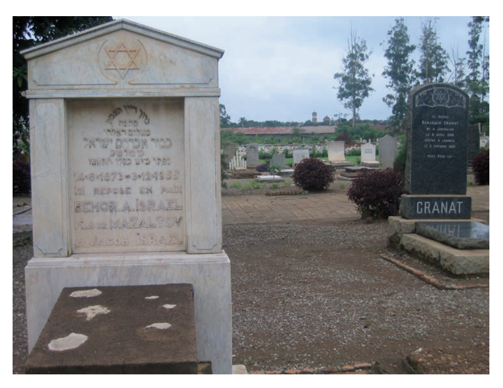
Fig. 5: Jewish cemetery, Lubumbashi

plex. Because of its particular geographical location, situated on the crossroads of Central and Southern Africa, Lubumbashi was a cosmopolitan urban enclave, in terms of both the European and the African population.<sup>54</sup> Rather than being connected directly to the rest of Congo, let alone, Kinshasa, the city was linked from 1910 onwards – the year of the city's foundation – to the outside world via a railroad coming up from Cape Town in South Africa via Bulawayo, a location in what is nowadays Zimbabwe.<sup>55</sup> Lubumbashi's urban culture thus was highly influenced by immigration from l'Afrique australe, while the large colonial enterprises operating in the city recruited their African labour from further afield. On top of this cosmopolitan aspect, social differences cut across Lubumbashi's urban society and structured relationships within as well as between the white and black urban communities.