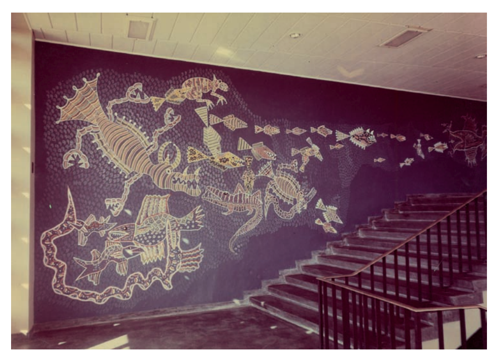
Fig. 4: Original interior view of the theatre building.

nent during the 1950s.<sup>39</sup> The decorative program of the theatre building was in tune with this architectural ambition. The interior decoration was executed by local, Congolese sculptors and painters, such as Mwenze Kibwanga, Bela and others who had been trained in the art studio of Pierre-Romain Desfossés and the Art academy of Laurent Moonens.