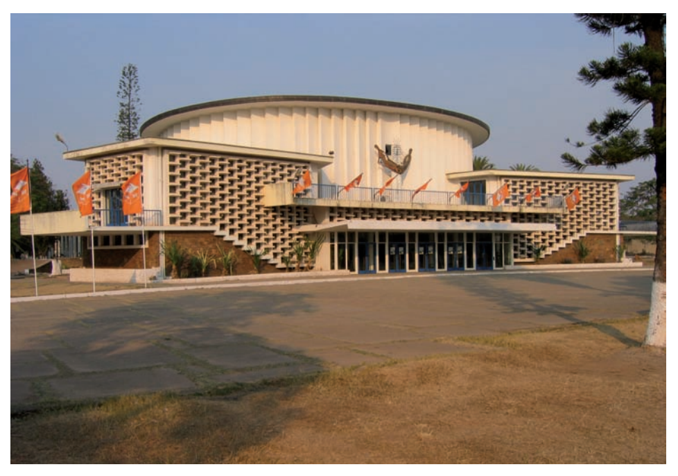
Fig. 2: Theatre building, Lubumbashi, arch. Yenga, 1953-56, (photograph Johan Lagae, 2005)

the need to address not only the tangible but also the intangible aspects of built form.<sup>33</sup> Moreover, the capacity of "lieux de mémoire" to take up new meanings over time – a capacity that for Nora was one of the main elements that made "lieux de mémoire" exciting – is particularly helpful to chart ruptures and continuities from colonial to postcolonial contexts, as the work on Algiers by Zeynep Çelik has so convincingly illustrated.<sup>34</sup>