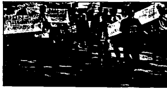
Comme prévu, la tentative de suppression a soulevé un tollé. Non sans quelques raisons... P.4